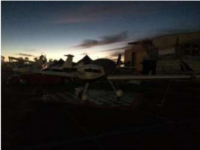
The Booth Closed for the Evening

You are going to see a couple pictures of my Jet. I am writing the Magazine ☺.