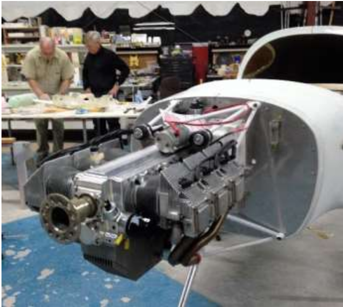
The Engine is Mounted