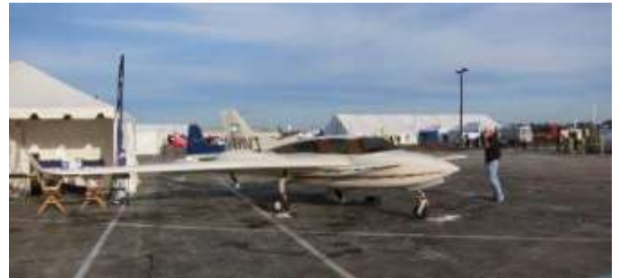
The Velocity Twin

As usual, Velocity was there even though they are not an LSA. They have been asked to show their plane at least the last few years and have flown it over from my home field, Sebastian Municipal Airport (X26)