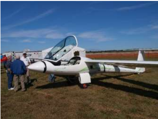
A Stemme Motor Glider

I always wanted to take a ride in one of these. Another day perhaps.