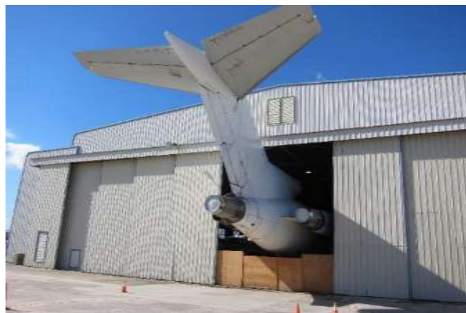
An Interesting Sight at the Expo

You almost never get a chance to see Crystal sitting. She is usually cleaning and waxing airplanes. Or on one cold Saturday morning, she made us hot cocoa. Thanks Crystal.