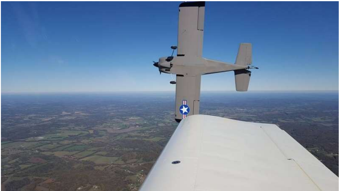
Nick's RV-6 – Break Off