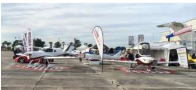
The Arion Booth

If you would like to look at all of the aircraft that were there, I am sure you can find them all at the LSA Expo web site, US Sport Aviation Expo . The following are pictures I took some other things to see around the show.