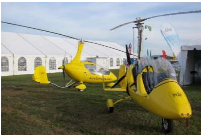
The Calidus Auto Gyro

The Auto Gyros were there, although I did not get a picture of them flying. They were definitely having fun when they were in the air.