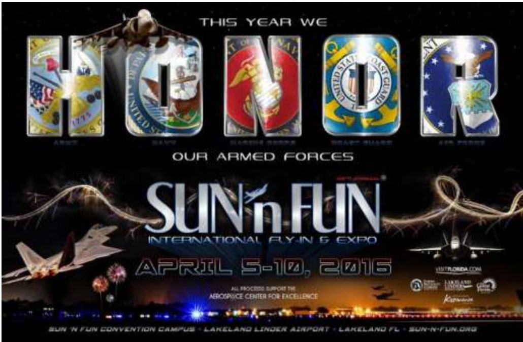
Sun-N-Fun Airport Identifier - KLAL