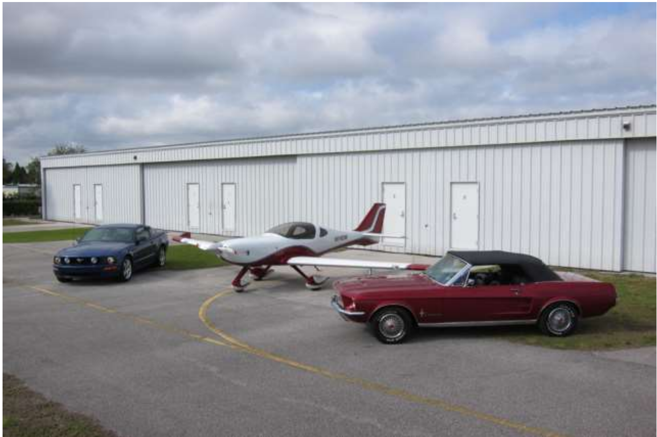
Two Mustangs and a Lightning

Russia and CIS, AVIA-NIANIA Ltd , Moscow, Russia, Phone: + 7495518-62-75, Mobile Phone: + 7925518-62-75, avianiania@mail.ru or avianiania@aol.com