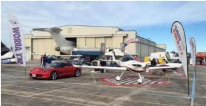
The Booth from a Different Angle