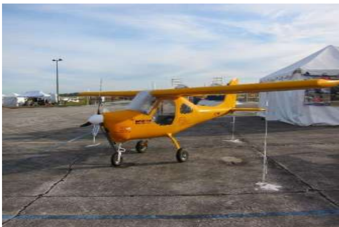
The Merlin PSA

There was a little plane at the show that may be getting some press. It is a small single place airplane that will have the capability to use a reciprocating engine or an electric motor. The Merlin PSA (Personal Sport Aircraft) is a kit built by Aeromarine LSA out of South Lakeland Airport in Lakeland, FL. You can do some simple searching on the web and get more information. Until the FAA is persuaded to change the Special Light Sport Aircraft rule, the electric powered plane cannot be certified as a Light Sport Aircraft. The company (and other hopeful electric powered aircraft manufacturers) are working to change the rule. They might get some high power assist since both Boeing and Airbus are looking at electric powered light aircraft.