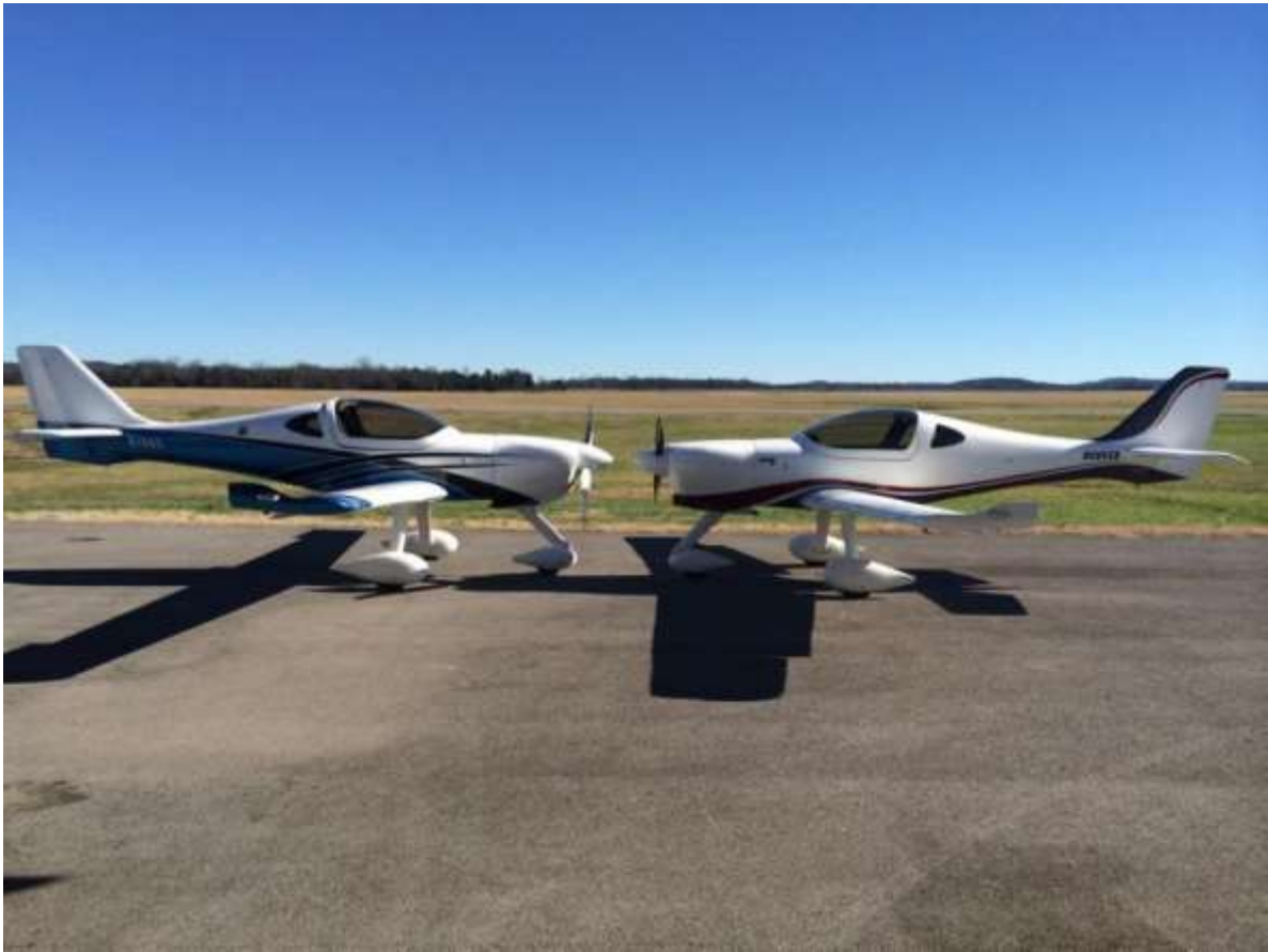
Two Fast Jets