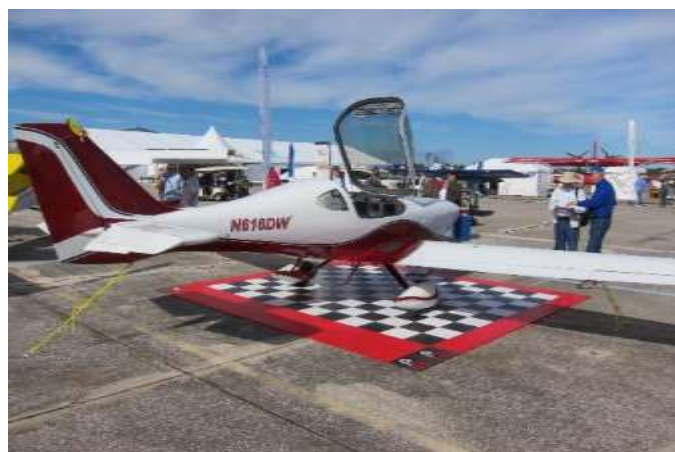
Greg Talking to a Potential Customer