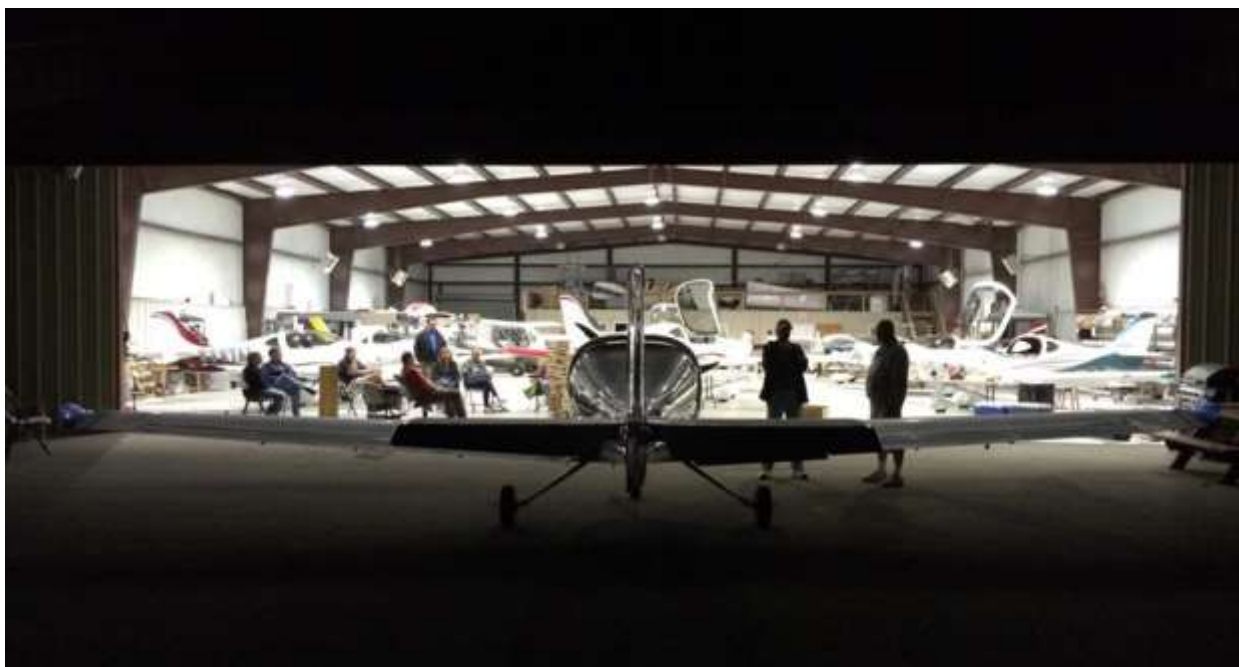
Lightning Homecoming 2014

Unfortunately, there has been no updates from Lightning owners on the Lightning list.