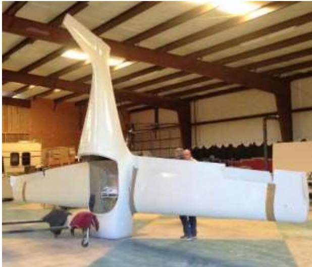
You Never Want to See This Again