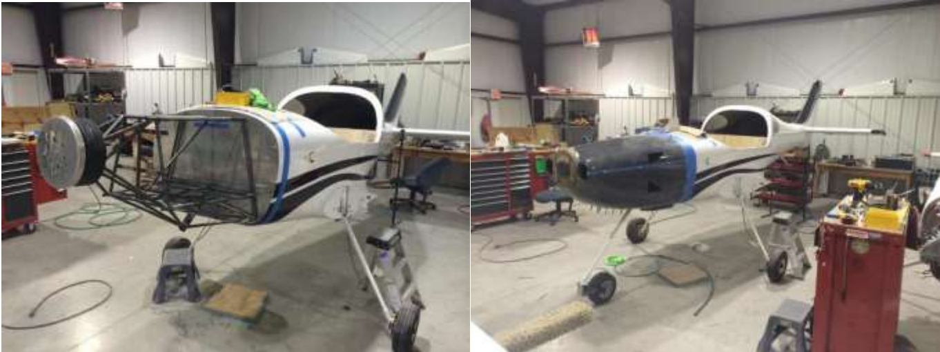
AEAC Electric Lightning Motor Mount and Cowling