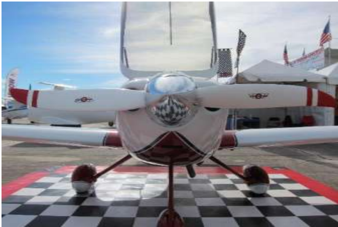
My Jet Again, with Some Reflections

At the end of the day on the last day of the Expo, we get a nice twilight photo of the XS. It was a good show and hopefully will eventually sell more than the one kit I know about. See you all there again next year.