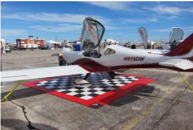
My Jet at the Expo

At the end of the day on the last day of the Expo, we get a nice twilight photo of the XS. It was a good show and hopefully will eventually sell more than the one kit I know about. See you all there again next year.