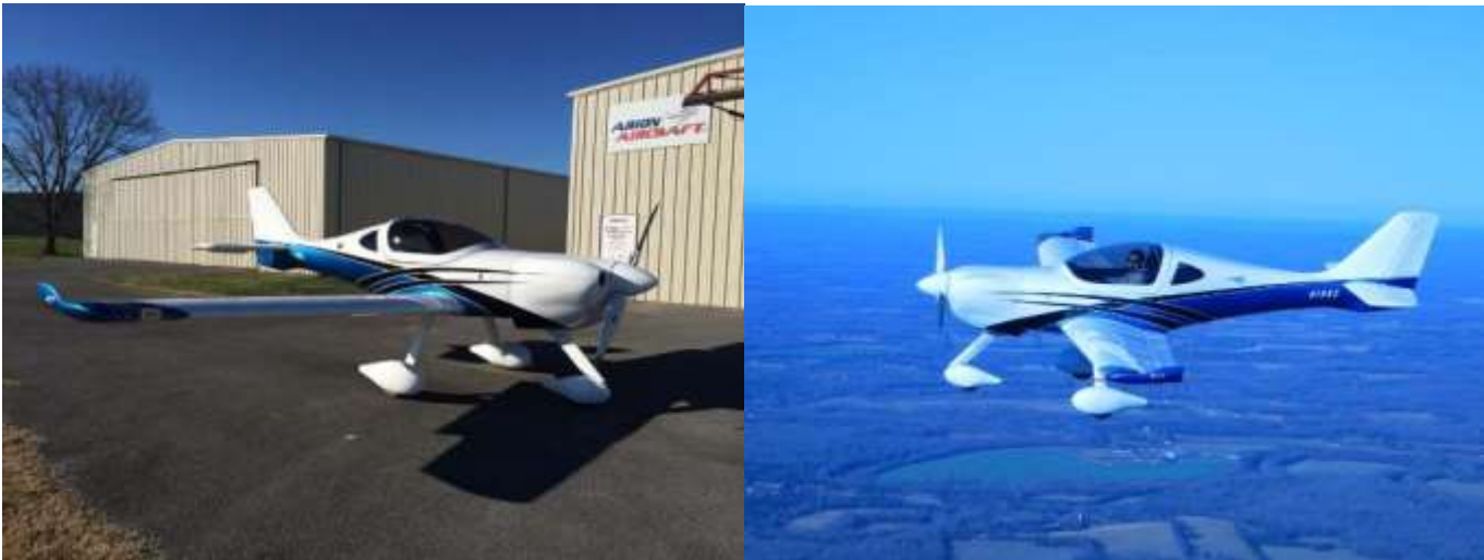
Neil Corella's Jet Finished and in Flight