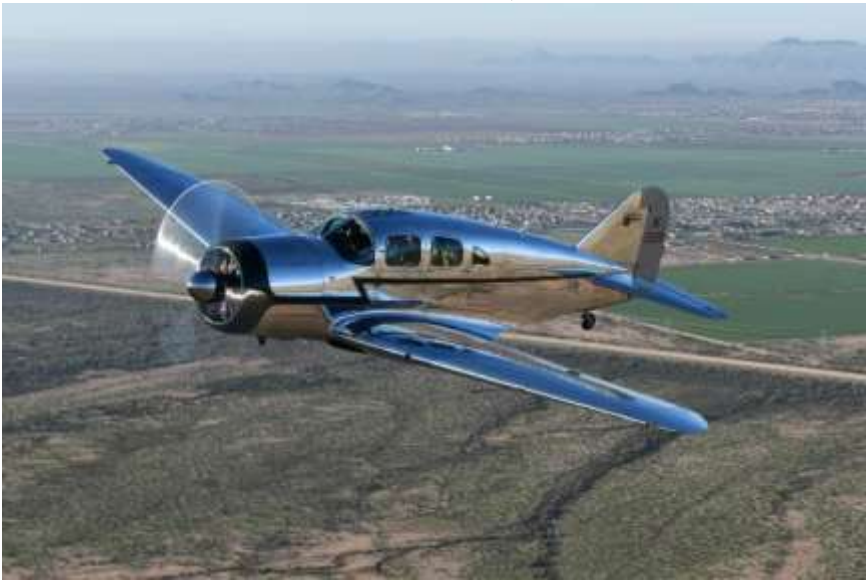
58th Annual Cactus Fly-IN Airport Identifier – KCGZ