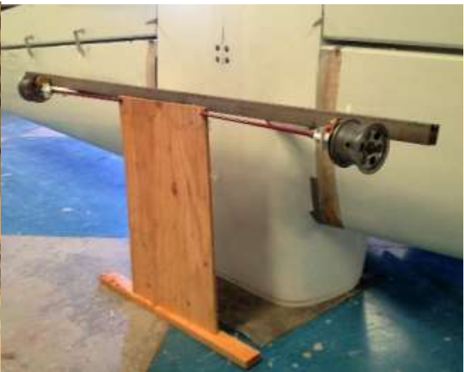
Aligning the Gear