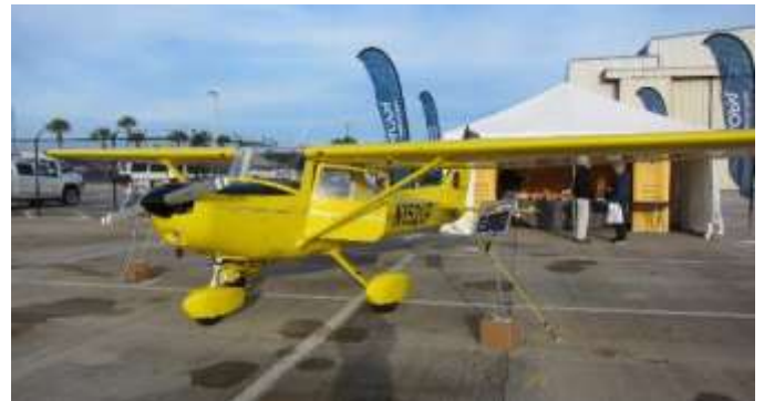
The AOPA C-152

AOPA had a presence as did the EAA. The South East Region representative (I may very well have his title wrong) was there flying in in his "company car", a beautifully restored C-152. The AOPA guys gave some forums and manned their booth and are very interested in helping people set up flying clubs. Having learned to fly in a flying club, I highly recommend this method for finding the least expensive method of obtaining your Private Pilot Certificate.