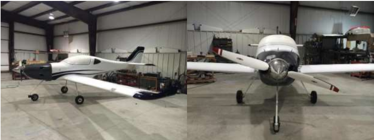
AEAC Airframe Complete