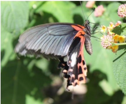
Fig.3: Papilio alcmenor , female, Bhowali