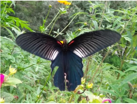
Fig.1: Papilio alcmenor , Bhatraunjkhana

Smith, C. 2006. Illustrated Checklist of Nepal's Butterflies . Walden Book House, Kathmandu. 2+129 pp.