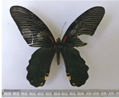
Fig.2: Papilio alcmenor , male, Bhowali