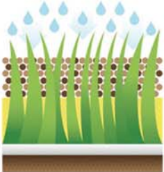
AN INITIAL WATERING RESULTS IN A UNIFORM INFILL LAYER.