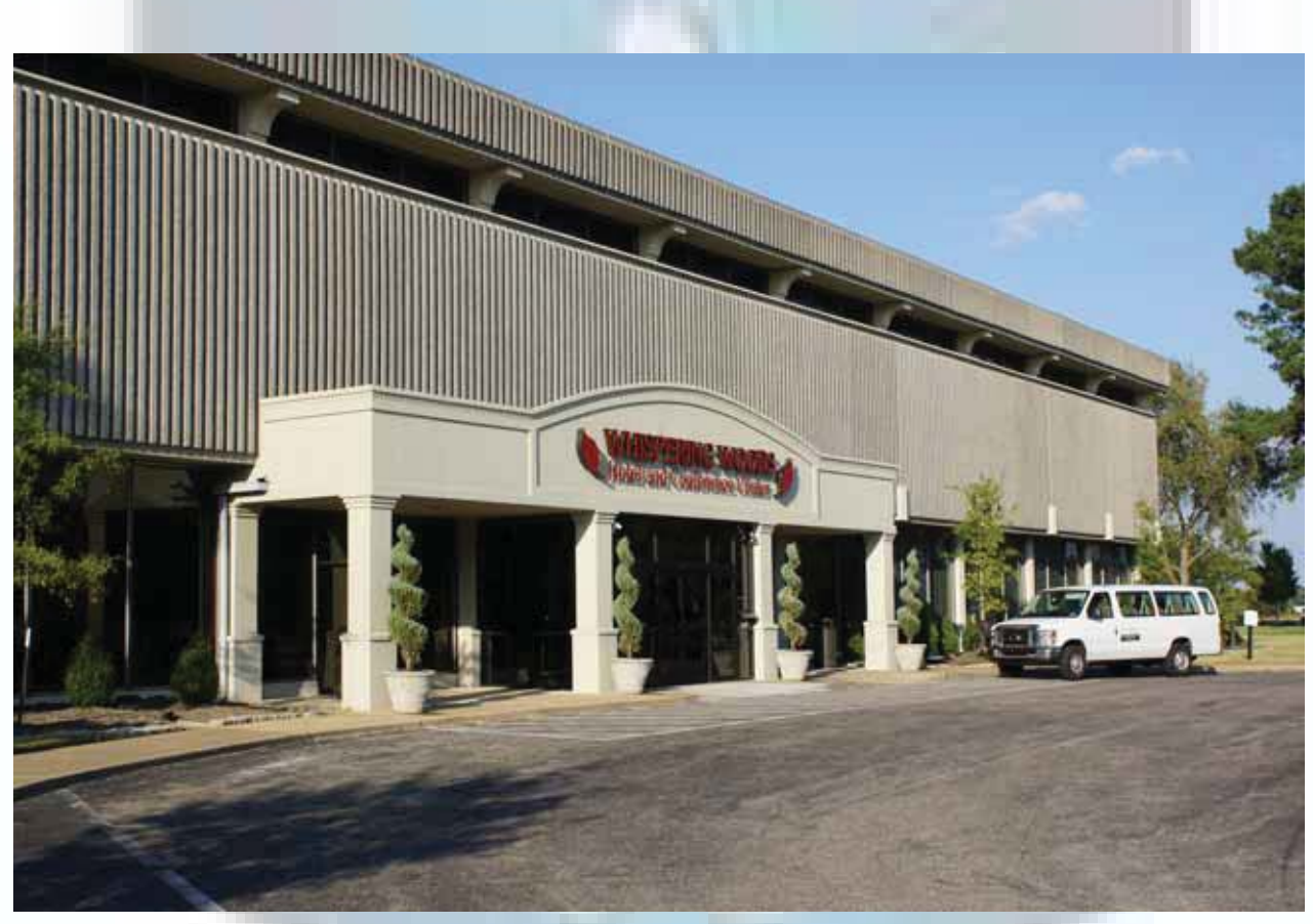
Our headquarters hotel...a former training facility for Holiday Inn managment