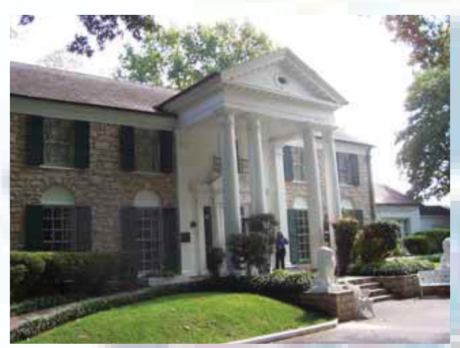
The elegant entrance to Graceland