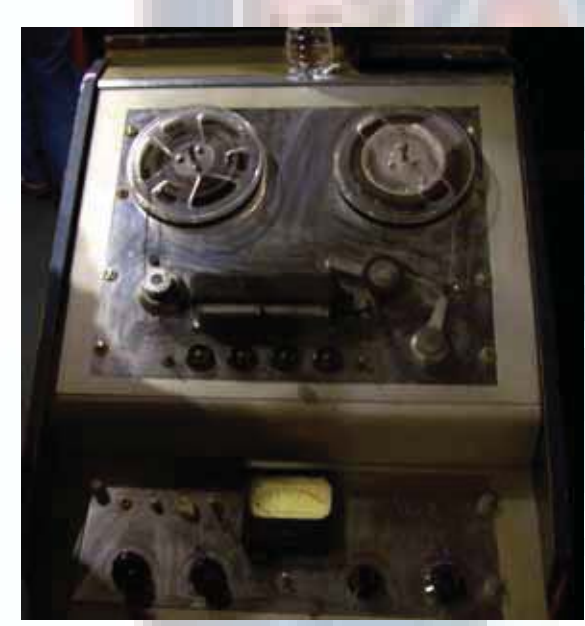
Does anyone recognize this? Upstairs at Sun Recording Studios