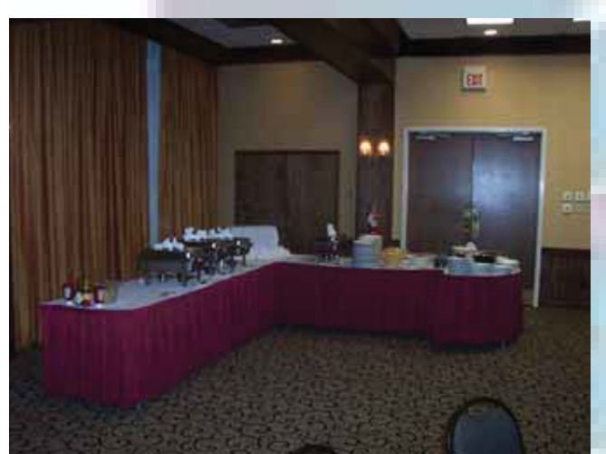
The table spread was fantastic! The AFVN Reunion Rock

complete with detailed descriptions, Ken Kalish donated two patriotic blankets, Chris Noel donated a couple autographed books and a DVD and many more items too numerous to mention. In all, we had 27 different cups set up to place the raffle tickets as one chose.