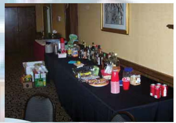
Our beverage selection was excellent!

complete with detailed descriptions, Ken Kalish donated two patriotic blankets, Chris Noel donated a couple autographed books and a DVD and many more items too numerous to mention. In all, we had 27 different cups set up to place the raffle tickets as one chose.