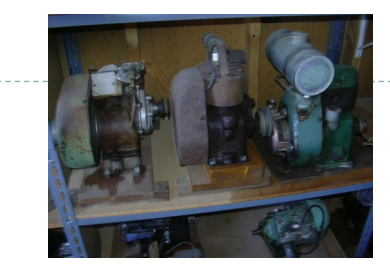
One of the Nightingale engines shown below.

Gary C. engine above. B. Peacock engines Below