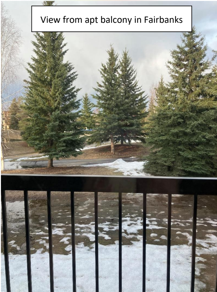
View from apt balcony in Fairbanks