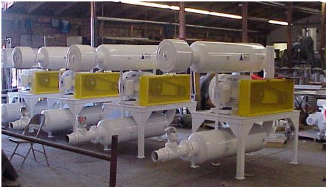
Table Top Blower Packages

Inline filter Sound enclosure Inlet panel Hose and fittings Convey tube and pipe Rotary airlocks and feeders Dehumidifiers Silo fluidizers Dirty air filter detector