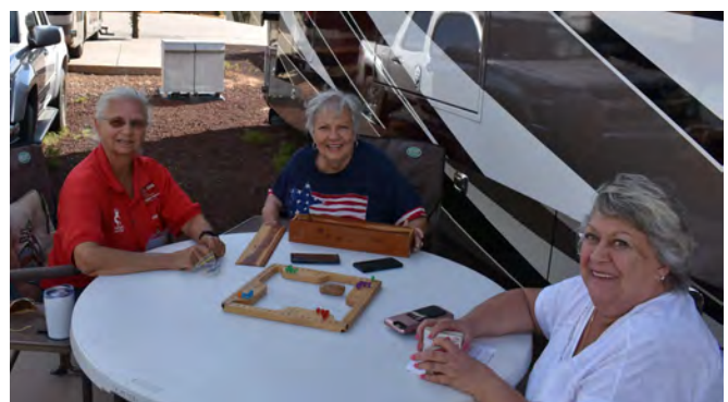
Game Players getting ready!

The town of Show Low offers wonderful restaurants and museum set up by a few town families. One day the residents realized they had quite the collection of old stuff. Needing a place to keep their unique items safe, they decided together to find a place to keep it. When the old police building in town became available they knew they had the perfect location.