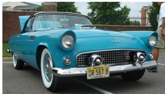
Bruce Corbett's 56