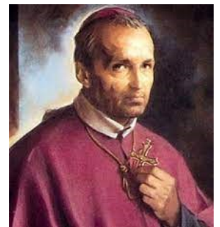
Feast Day: November 4

Sources: franciscanmedia.org , catholic.org