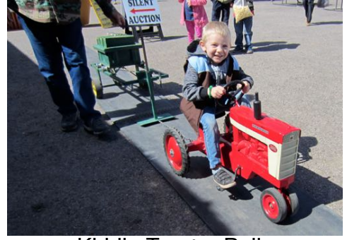
Kiddie Tractor Pull