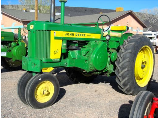
John Deere 720