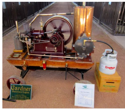
Gardner Stationary Engine