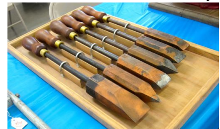
Vintage soldering irons