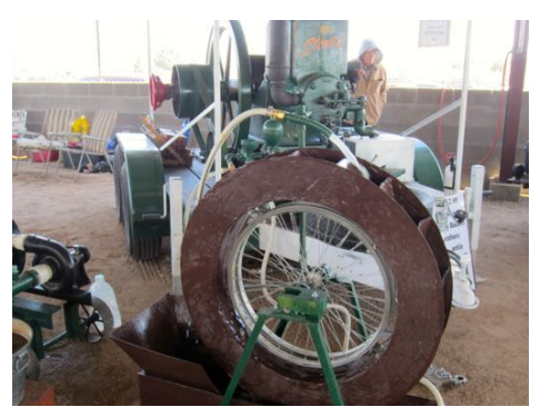
Stover & water wheel