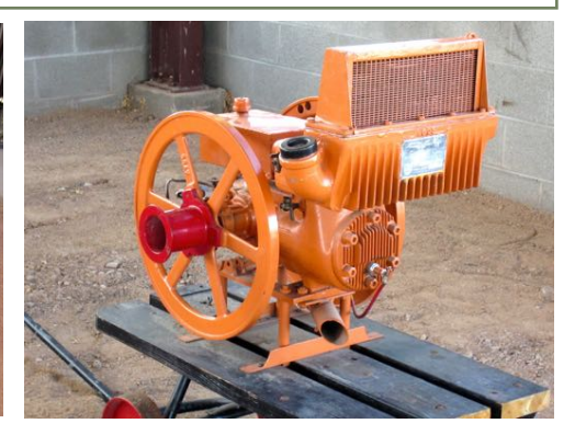
Fairmont Motor Co.