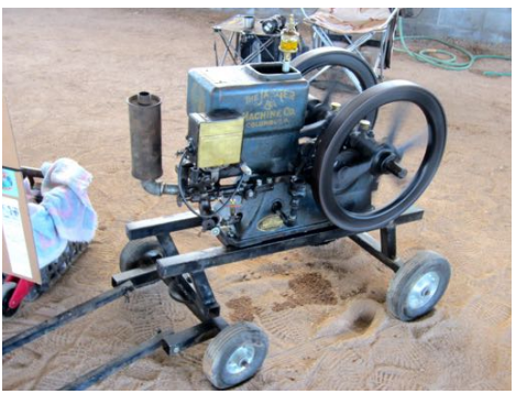
Jagaer 1 3/4 HP S