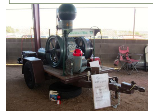
Lister Vertical Engine

A number of days before our show the National Weather Service was predicting moderate to heavy rain for the Verde Valley. Verde Valley Fairgrounds offered the use of covered areas for the Silent Auction, an indoor Swap Meet and large engines. We graciously accepted. BTW, it didn't rain!