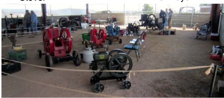
Indoor engine display area (this year's show)