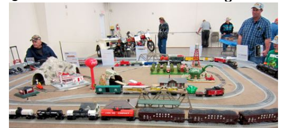
Sedona Model Railroad Club