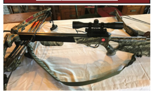
Red Head Kronik , Nova PSC, and Bear Instinct, and PSE compound bows