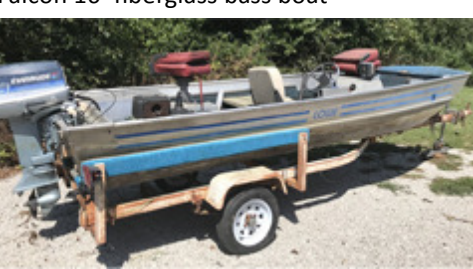
Lowe 12' fishing boat