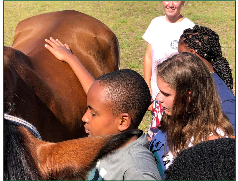
Campers touching and learning about horses

What we need is everyone to do is trust your Board of Directors to make the right decisions, find more campers and help find donations for the camp. There is a Lion that is working on funding sources at no charge. In time, there will be success but in the meantime, we all can help. There are multiple ways to personally donate to the camp, Memorial Garden, 1976 Society, Volley's Jar to name a few.