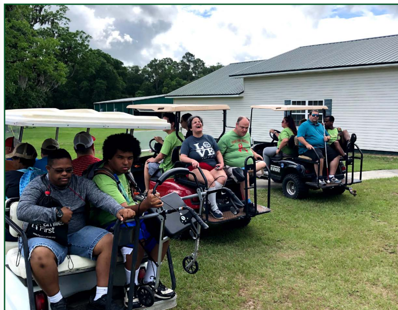
Campers enjoying golf cart rides