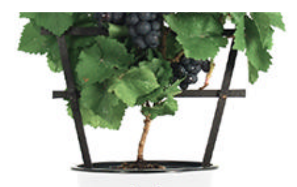
pixie Vitis Pixie Grap oes Cabernet Franc