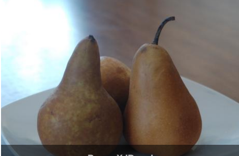
Pyrus X 'Bosc'