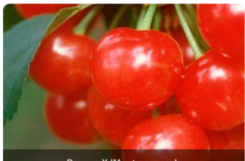
Prunus X 'Montmorency'

NEW! (Semi-Dwarf) The Tomcot<sup>TM</sup> Apricot is a consistently good producer of yellow fruit with a ruby blush where the sun has touched the skin. It's a vigorous selection and partially self-pollinating meaning it will set considerable fruit on its own in your backyard garden but would set far heavier crops if pollinated by another selection of Apricot. It's an early maturing Apricot producing luscious fruit for you to pick and eat right off the tree in late July and early August. While its fruit will be tasty preserved it holds up best as a dessert quality Apricot that will have you drooling for more! Plant Tomcot<sup>TM</sup> in spots where spring frosts are less frequent because its massive pink bloom in late April or early May can be damaged causing poor fruit set. All Apricots love full sun and well-drained soil.