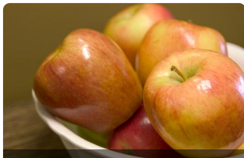
Malus X 'Honeycrisp