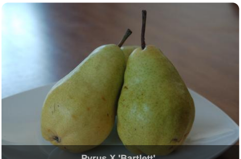
Pyrus X 'Bartlett'