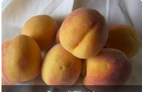
Prunus X 'Elberta'