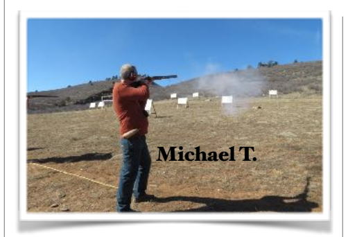
More upcoming shoots

May 4th Pistol & Revolver Shoot at the Fort Lupton Range 9 AM until 3 PM.