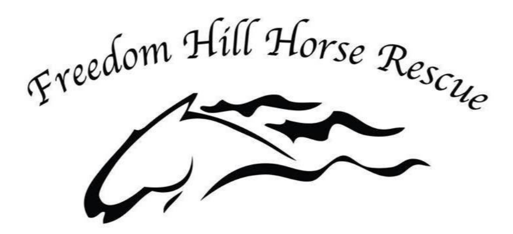
Free to Live Again!