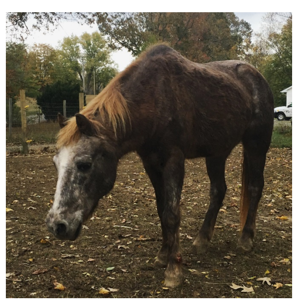
Maggie