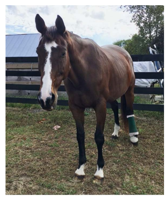
Gold Story "Goldie" with her leg wrapped

With the aid and advice of our veterinarians and extensive research by several volunteers, we have tried many, many different things to help improve Goldie's condition and prevent further damage. We