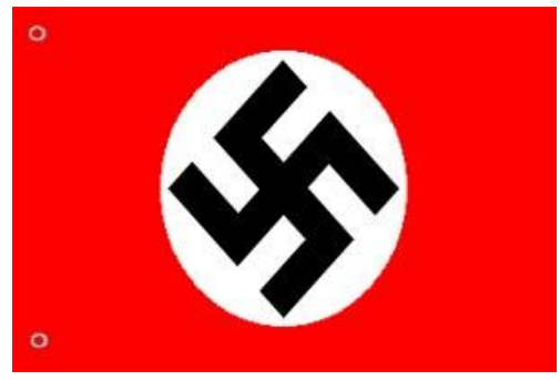
The Swastika is a work of ancient art that finds roots in Hinduism/India.