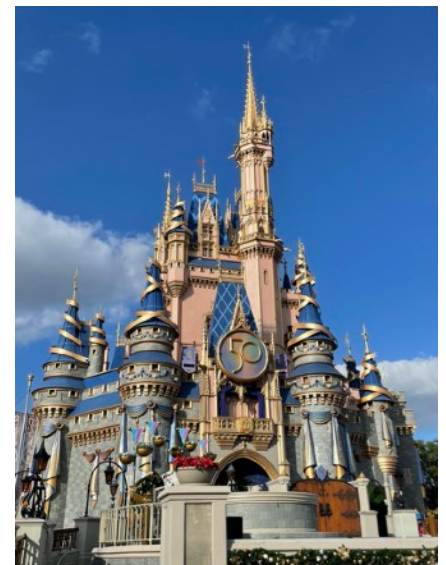
DISNEY WORLD CELEBRATES 50 YEARS!