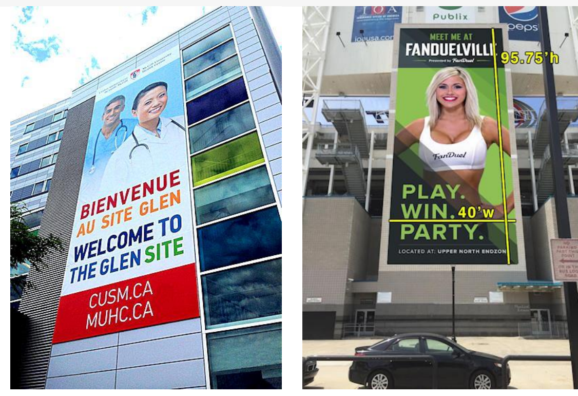
Hospital Entrance - 41' x 17'