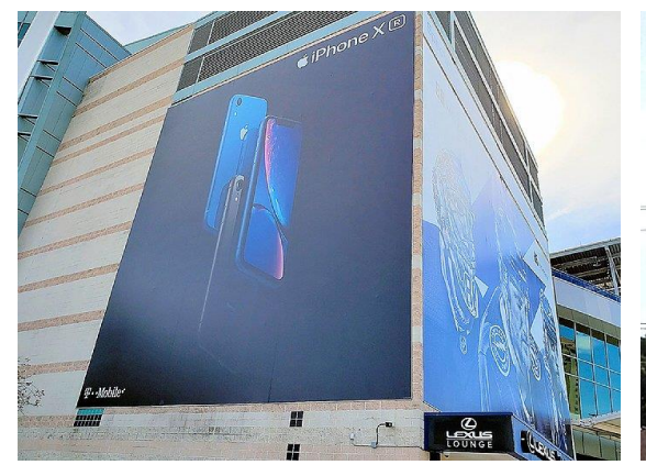
Arena Entrance -48' x 65'