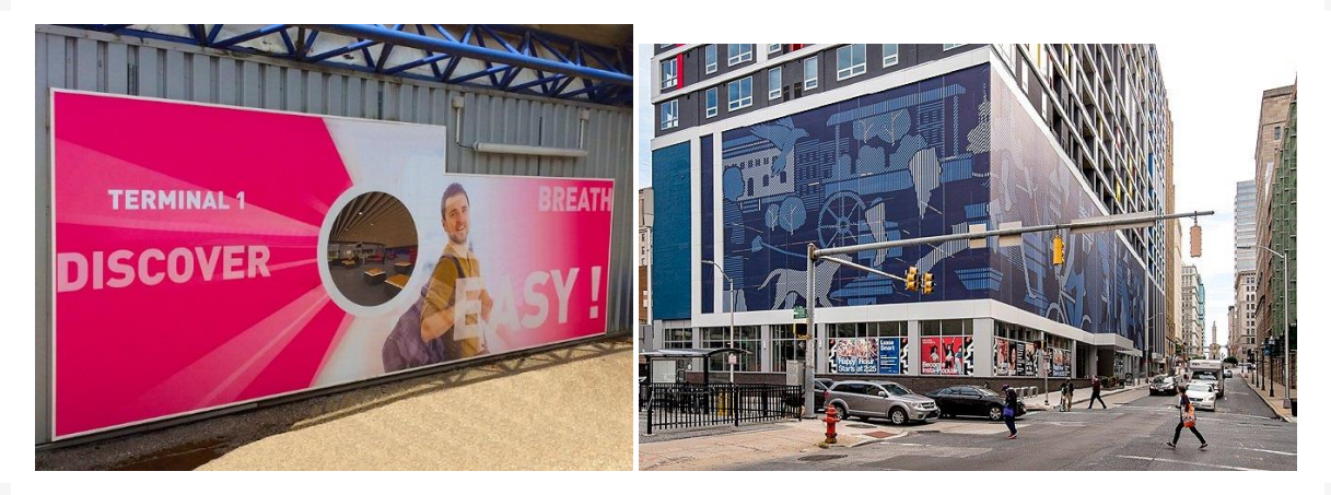
Non-Rectangular Frame with a perfect stretch