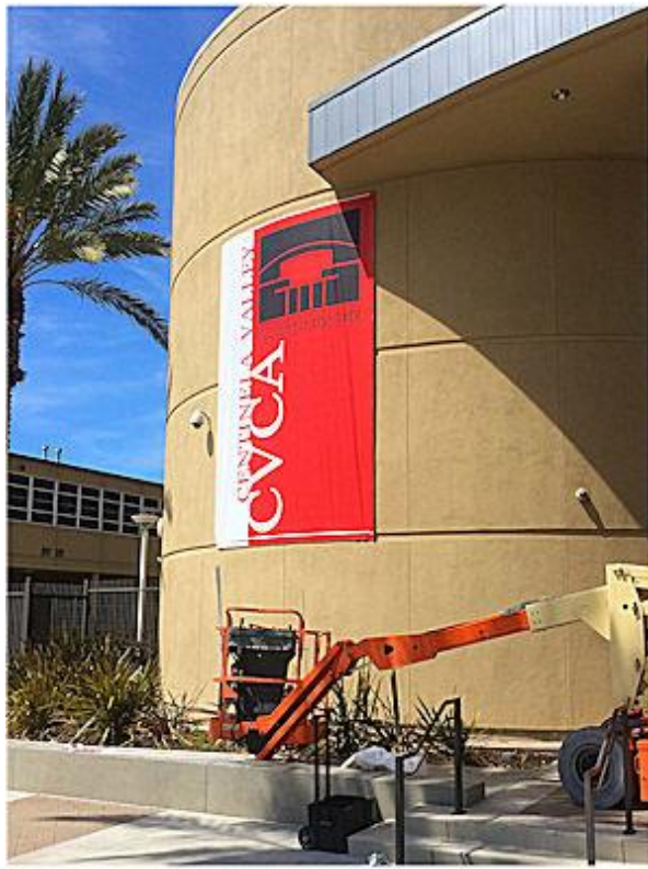
Works Fine with Curved Frames...