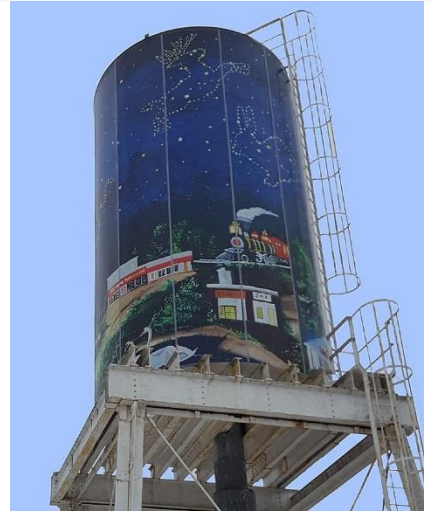
Decommissioned Water Tower-Decorative Graphic