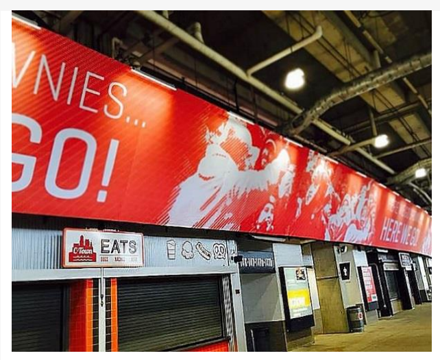
Food Court Vinyl Banner- 310' x 113' - Browns stadium