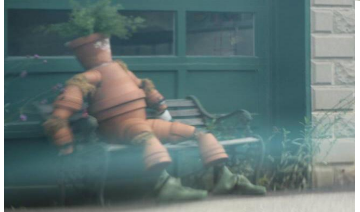
This guy really went to pot (Couldn't resist)