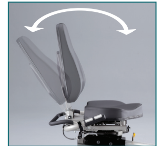
MULTI SEAT ADJUSTMENTS