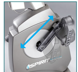
ADJUSTABLE PEDAL CRANKS