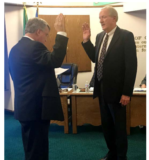
Commissioner Tom Quigg is sworn in to serve as District 2 Port Commissioner through December 31, 2023.