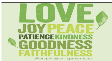
Mt. Carmel Baptist Church Seabrook, SC