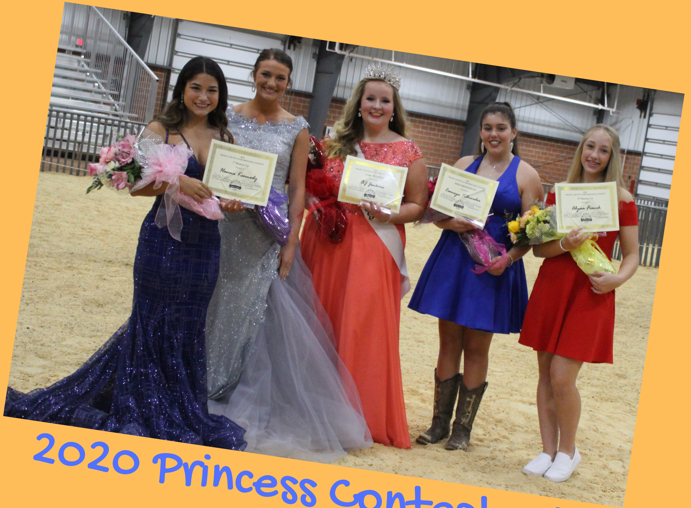
2020 Princess Contestants