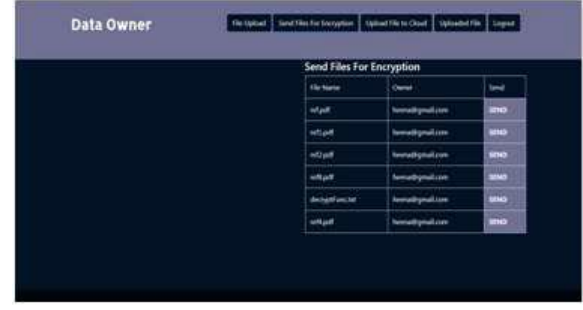
Fig -6: After clicking on send files for encryption in data owner page