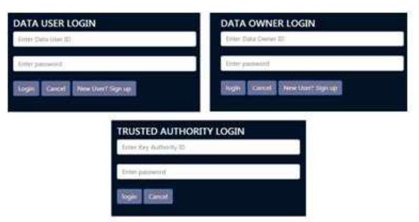
Fig -2: Login page for Data User, Data Owner and Trust

It uses the LDSS, the data protection for the mobile cloud and also reduces the overhead on the user's side of the mobile cloud. The data customer, data owner and trustee listing is given as shown in Fig 2. There are the data owner and device authentication calculations shown in Figure 3. The Home Page shown in Fig 4 is for the customer, data owner and secrecy. The following page pops up as shown in Fig 5 depending on the specific user. The file will be transferred to the data owner and sent for encryption in Figure 6.