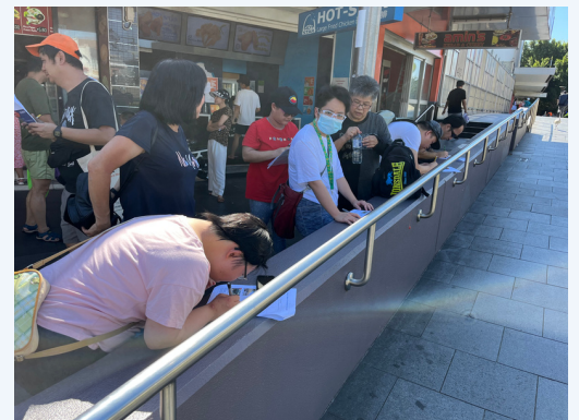
ACAP Project Cultural trips and Powerhouse Museum visit