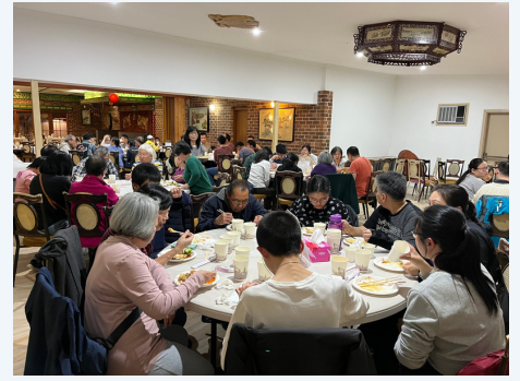
Seaside Family Weekend Getaway 21-23 April 2023