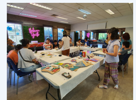
Belmore Weekend Programs