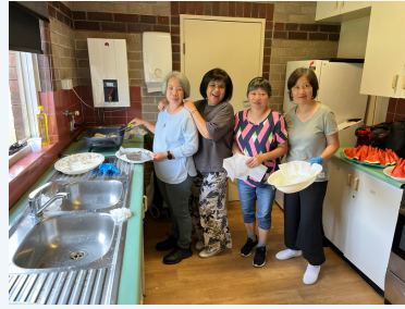
Belmore Monthly Birthday Party