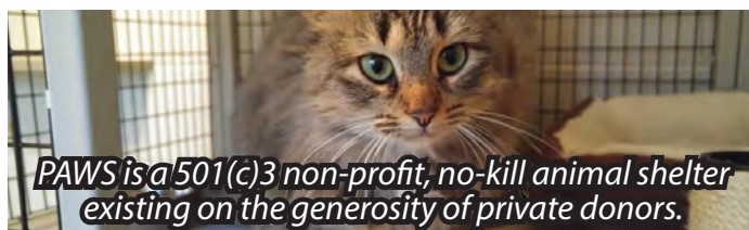
PAWS is a 501(c)3 non-profit, no-kill animal shelter existing on the generosity of private donors.

Send your tax deductible contribution to: PAWS Animal Shelter PO Box 1814 Bryson City, NC 28713