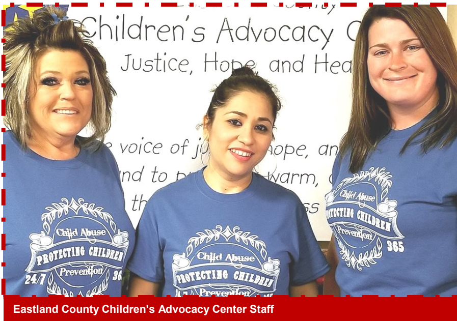
Eastland County Children's Advocacy Center Staff