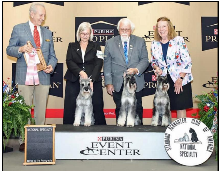
Flicka pictured with her son "Dingo" and daughter "Roo" – both 13 months old.