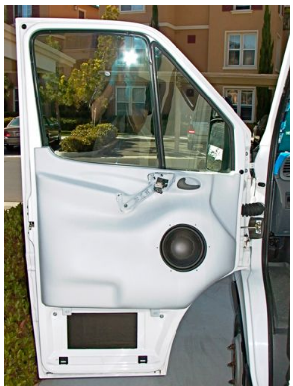
Figure 32. A two-component polyester high-build primer was sprayed onto the door panel. The primer was block-sanded with 320-grit sandpaper prior to the application of the color-matched, textured, two-component finish. While I did the sanding, Jorge Perez at Tri-City Paint (visit <u>www.tcpglobal.com</u>) expertly sprayed the parts with primer and paint. If you live in the San Diego area, I highly recommend Jorge's work.

Figure 31. The fiberglass composite panel was filled and contoured with Evercoat®'s Rage Gold® body filler. 3M's Duramix<sup>™</sup> 4058 E-Z Sand Plastic Finishing Paste was used to fill the transition from the PP/EPDM door panel to the fiberglass composite panel. The entire door panel was block-sanded with 80-grit sandpaper in preparation for primer.