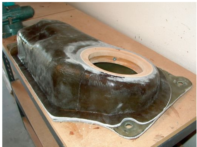
Figure 14. The edges of the front half of the enclosure were trimmed and sanded to match the edges of the back panel.

Figure 13. The KLEAN KLAY® and foam blocks were removed from the molded part. Notice the perfectly formed flange along the outside edge of the enclosure half. All fiberglass composite surfaces that were in contact with KLEAN KLAY® and mold release were thoroughly cleaned with acetone to remove any traces of residue.