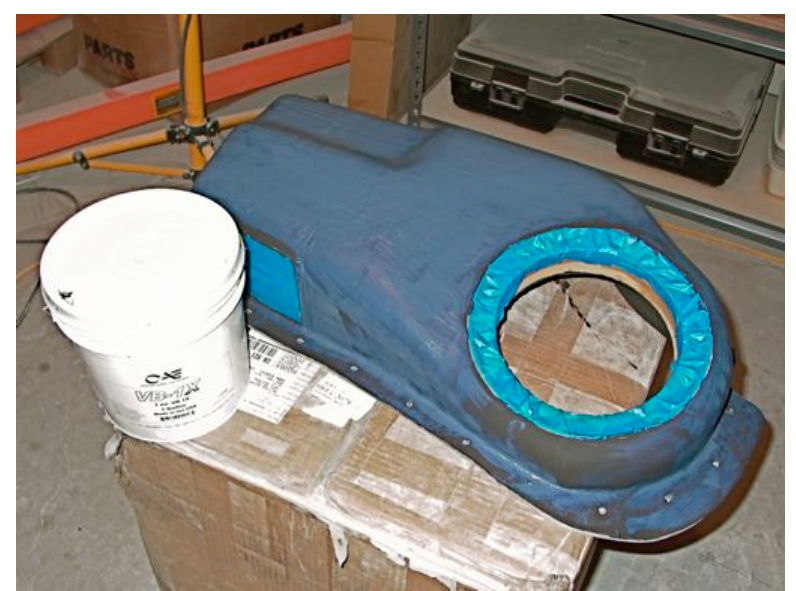
Figure 19. Seven successive applications of Cascade Audio's VB-1X were applied to the exterior surfaces of the enclosures' front and back panels. The total thickness of VB-1X applied to the inside and outside surfaces of the enclosures was nearly equal to the thickness of the fiberglass composite substrate.