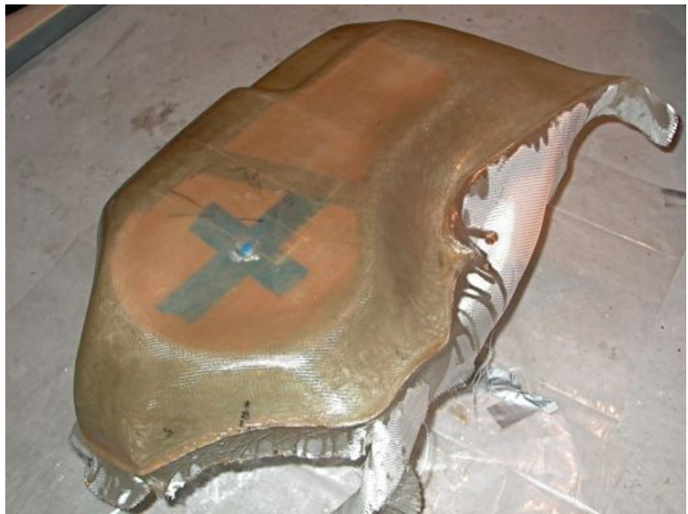
Figure 26. Additional layers of fiberglass composite, comprised of 8.8 oz. twill woven roving and polyester laminating resin, were applied to the molded panel until the thickness reached at least 6 mm (0.236 in).

Figure 25. The molded door panel was removed from the door, but the mold came with it. The KLEAN KLAY® and the wood form were subsequently removed. KLEAN KLAY® residue was thoroughly removed using acetone. The inside surface of the molded part was sanded with 36-grit sandpaper and again thoroughly cleaned with acetone.