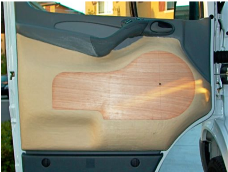
Figure 23. The finished door panel mold was liberally coated with mold release.