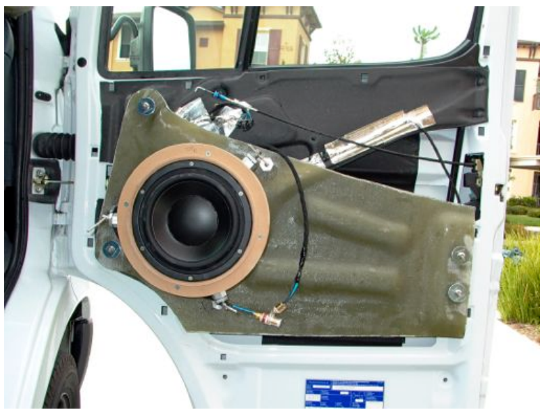
Figure 5. With the back panel mounted in its rubber isolation system, the loudspeaker transducer was appropriately aimed using my proprietary articulating mounting fixtures. Cascade Audio's VB-2 damper was applied to the inner door "skin", while several layers of Cascade Audio's VMAX was applied to the inner surface of the outer door skin.