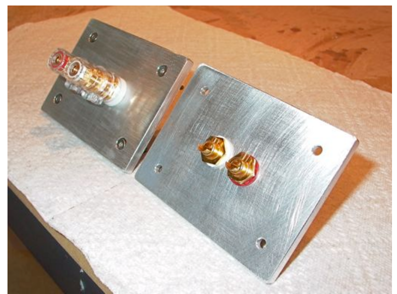
Figure 15. Binding post plates were machined from <sup>1</sup>/<sub>4</sub>-inch (6.35 mm) thick 6061-T6 aluminum, into which WBT binding posts were mounted.