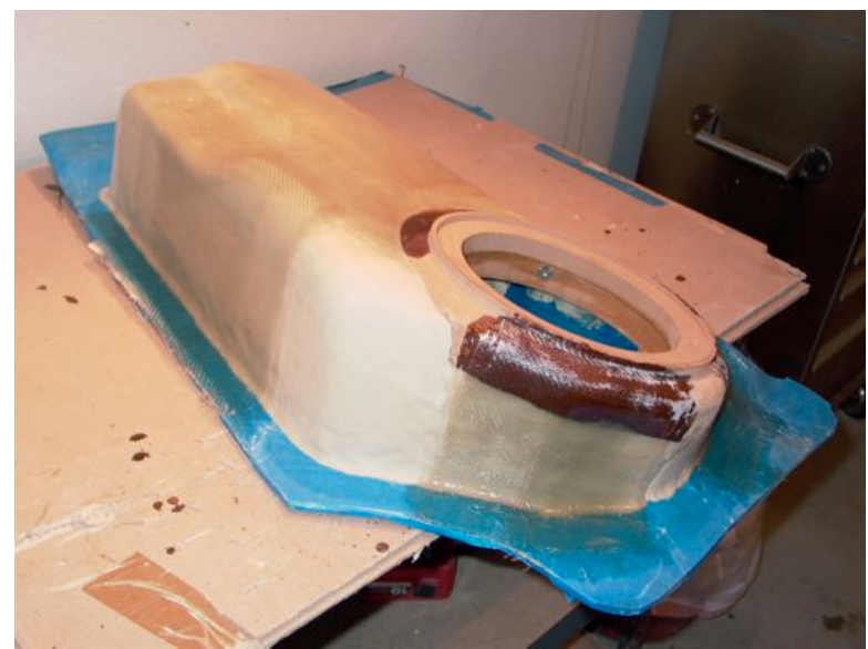
Figure 11. Additional KLEAN KLAY® was used to fill in the voids left by the mounting fixtures.