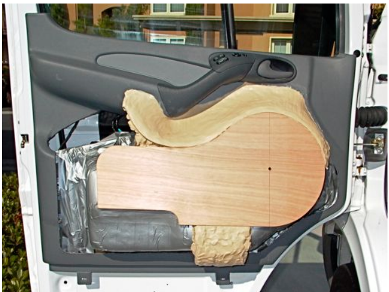
Figure 22. The mold for the new door panel was fashioned from plywood and KLEAN KLAY®. Duct tape was used to protect the underlying structures from KLEAN KLAY® residue.

The door panels were designed to be completely isolated from the door enclosures to minimize the transmission of vibrations. Figures 22 through 34, inclusive, show the fabrication steps typical for a typical door panel.