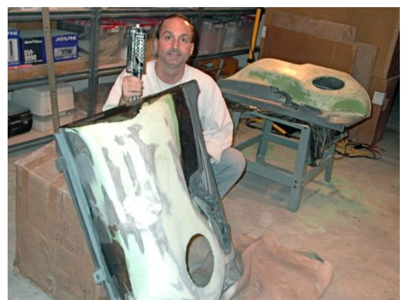
Figure 31. The fiberglass composite panel was filled and contoured with Evercoat®'s Rage Gold® body filler. 3M's Duramix<sup>™</sup> 4058 E-Z Sand Plastic Finishing Paste was used to fill the transition from the PP/EPDM door panel to the fiberglass composite panel. The entire door panel was block-sanded with 80-grit sandpaper in preparation for primer.