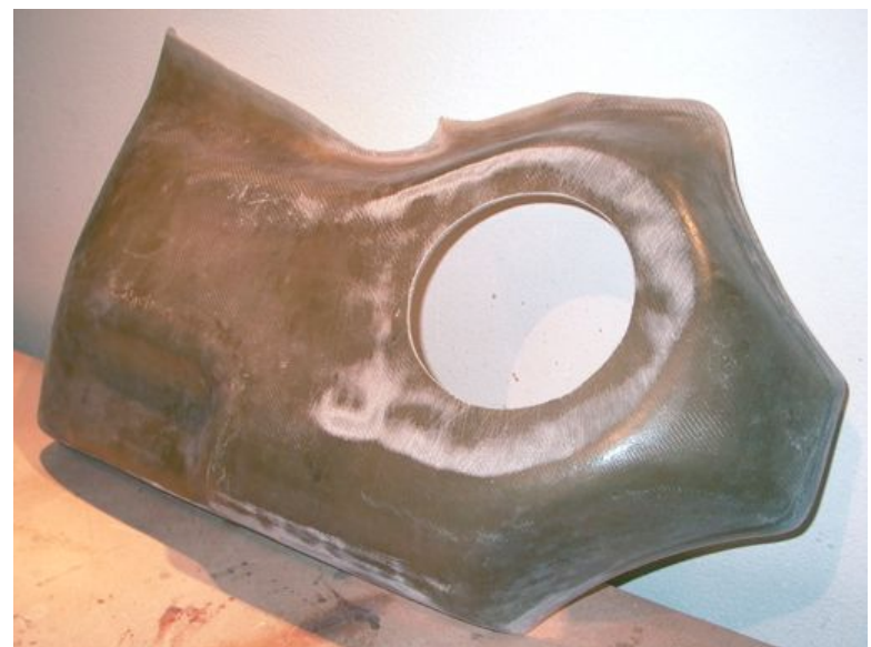
Figure 27. The edges of the panel were carefully cut to match the contours of the factory door panel. The hole for the loudspeaker transducer was also cut.