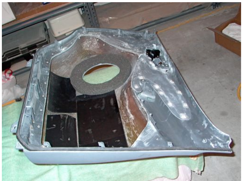
Figure 33. A ring of acoustical foam was applied to the inside of the door panel to act as a gasket between the door panel and the loudspeaker transducer. The gasket covers six M4 x 0.7 t-nuts, adhesively bonded to the inside of the door panel with Duramix<sup>TM</sup> 4040, configured to form the bolt circle for the loudspeaker transducer grill. Layers of VMAX were applied to the inner surface of the door panel.