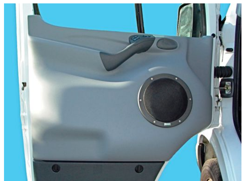
Figure 34. View of the finished door panel with Dynaudio's MW180 speaker grill installed. The total added weight of the isolated, highly damped, rigid, loudspeaker enclosure and door panel was about 50 lb (222 N)!