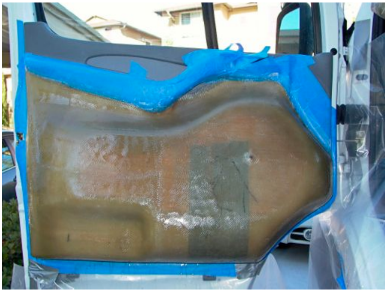
Figure 24. Blue masking tape and clear plastic sheet was used to protect surfaces from errant resin. The first four to six layers of fiberglass composite, comprised solely of 8.8 oz. twill woven roving and polyester laminating resin, were applied on the door mold and allowed to cure overnight.