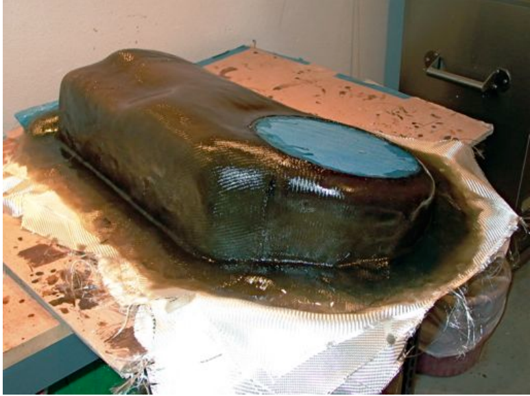
Figure 12. Numerous layers of fiberglass composite, comprised of 8.8 oz. twill woven roving and polyester laminating resin, were applied until the enclosure wall thickness reached about 12 mm (0.472 in), in accordance with the guidelines established in Part 5.