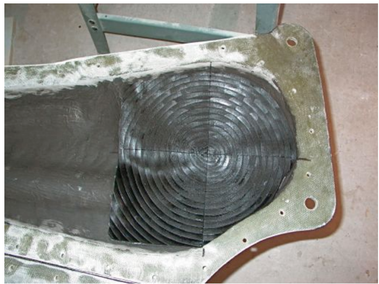
Figure 20. Cascade Audio's Deflex Power Pad was custom cut and bonded to the inside surface of each back panel using cyanoacrylate gel adhesive.

Figure 19. Seven successive applications of Cascade Audio's VB-1X were applied to the exterior surfaces of the enclosures' front and back panels. The total thickness of VB-1X applied to the inside and outside surfaces of the enclosures was nearly equal to the thickness of the fiberglass composite substrate.