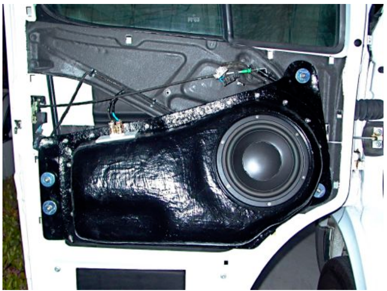
Figure 21. Finished door enclosure installation. The finished weight of each enclosure was about 35 lb (156 N).