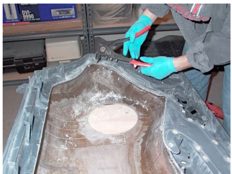
Figure 30. Aluminum peel rivets were installed to augment the adhesive bond with a mechanical bond.

Figure 29. A substantial fiberglass composite gusset was added to bridge, and further reinforce, the bond between the factory door panel and the fiberglass composite door panel.