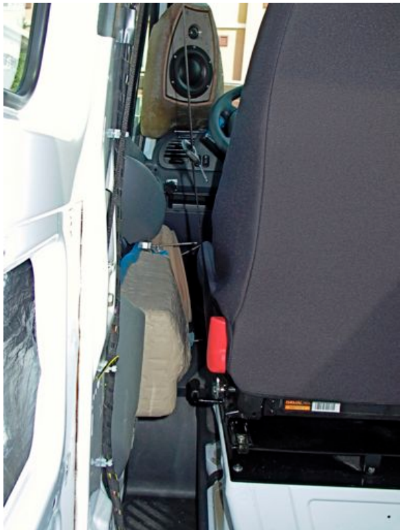
Figure 8. The driver's seat and seat swivel base restricted both the upward aim of the loudspeaker transducer and the protrusion of the enclosure into the cockpit area. Sufficient clearance to all objects was required in order to allow appropriate clearance for the door panel.

Figure 7. The mold for the front half of the enclosure was formed from foam blocks and KLEAN KLAY® (Art Chemical Products, visit <u>http://www.kleanklay.com</u>). The back panel and the MDF ring were protected with masking tape to prevent the absorption of clay residue.