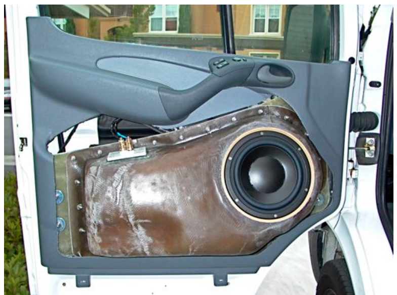
Figure 17. The MW180 loudspeaker transducer was installed in the enclosure for preliminary listening evaluation and tuning. The center of the factory door panel was cut away to make room for the enclosure.