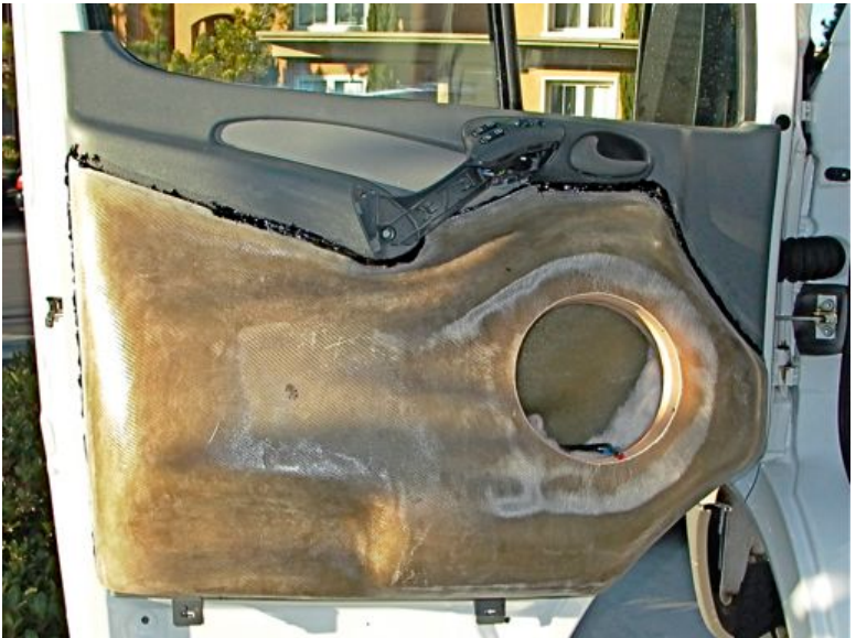
Figure 28. The factory door panel, comprised of a PP/EPDM copolymer, was sanded with 36grit sandpaper and primed with 3M's Duramix<sup>™</sup> TPO Adhesion Promoter. The fiberglass panel was bonded to the factory door panel using 3M's Duramix<sup>™</sup> 4036 Thermoplastic Olefin TPO Repair adhesive. After the adhesive cured for 24 hours, the door panel assembly was removed and a liberal fillet of Duramix<sup>™</sup> 4036 was applied to the inside of the bond line.

Figure 27. The edges of the panel were carefully cut to match the contours of the factory door panel. The hole for the loudspeaker transducer was also cut.