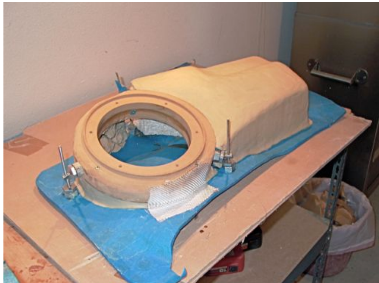
Figure 9. The MDF loudspeaker transducer mounting ring was appropriately shaped to accommodate layers of fiberglass composite. The mold was fashioned to allow room for a flange, which would allow the two molded halves to be bolted together. Liberal amounts of mold release were applied to the KLEAN KLAY® and masked surfaces.