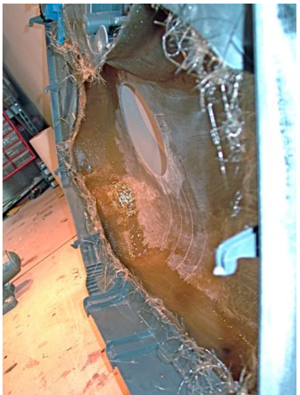
Figure 29. A substantial fiberglass composite gusset was added to bridge, and further reinforce, the bond between the factory door panel and the fiberglass composite door panel.