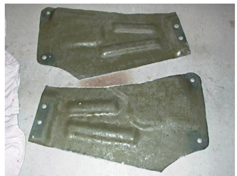
Figure 3. The door enclosures' back panels were formed from fiberglass composite comprised of woven roving. The complex curvature and ribs were intended to increase stiffness. The four mounting holes accommodated the rubber isolators.