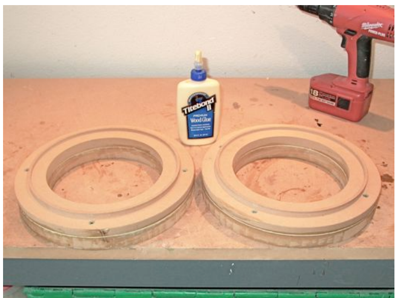
Figure 4. Loudspeaker transducer mounting rings were machined from 1-inch thick (nominal) MDF. An additional MDF ring was bonded to the machined rings to increase the overall thickness to 50.8 mm (2 in). M4 x 0.7 t-nuts were bonded to the backside of each ring, configured to match the loudspeaker transducer's bolt circle.

Figure 3. The door enclosures' back panels were formed from fiberglass composite comprised of woven roving. The complex curvature and ribs were intended to increase stiffness. The four mounting holes accommodated the rubber isolators.