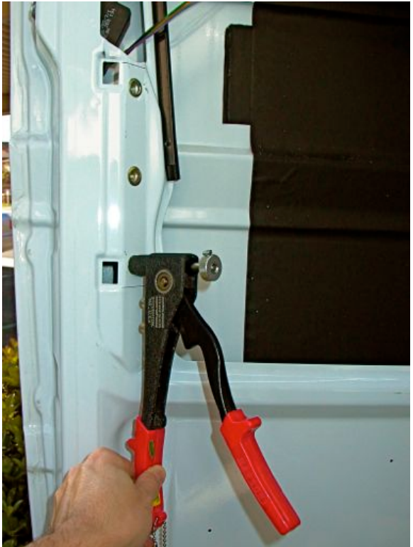
Figure 2. Five M8 x 1.25 rivet nuts were installed in each door. The pullout strength of each rivet nut was 15.7 kN (3,522 lb).

Figure 1. Aluminum brackets were machined and mounted to the rear edges of the doors to secure the rear edges of the door enclosures. One of the four rubber isolators is shown.