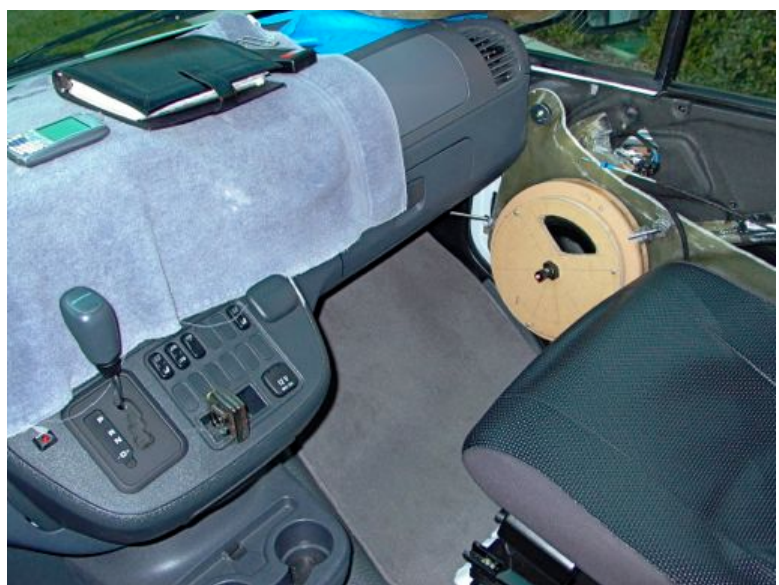
Figure 6. A magnetically attached jig, equipped with a laser gun sight, provided for precise aim. Notice the two red dots on the back edge of the tape measure, resting on the center console, were perfectly coincident.

Figure 5. With the back panel mounted in its rubber isolation system, the loudspeaker transducer was appropriately aimed using my proprietary articulating mounting fixtures. Cascade Audio's VB-2 damper was applied to the inner door "skin", while several layers of Cascade Audio's VMAX was applied to the inner surface of the outer door skin.