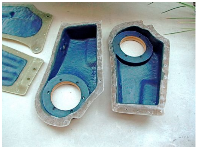
Figure 18. Ten successive applications of Cascade Audio's VB-1X were applied to the interior surfaces of the enclosures' front and back panels.

Figure 17. The MW180 loudspeaker transducer was installed in the enclosure for preliminary listening evaluation and tuning. The center of the factory door panel was cut away to make room for the enclosure.