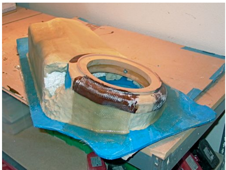
Figure 10. The first layers of fiberglass composite secured the MDF loudspeaker transducer mounting ring into position, enabling the mounting fixtures to be removed.

Figure 9. The MDF loudspeaker transducer mounting ring was appropriately shaped to accommodate layers of fiberglass composite. The mold was fashioned to allow room for a flange, which would allow the two molded halves to be bolted together. Liberal amounts of mold release were applied to the KLEAN KLAY® and masked surfaces.