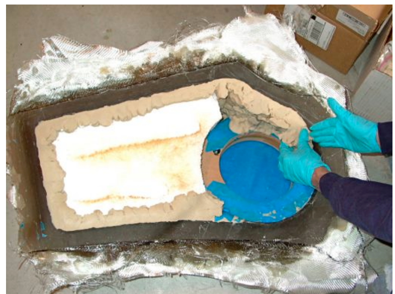
Figure 13. The KLEAN KLAY® and foam blocks were removed from the molded part. Notice the perfectly formed flange along the outside edge of the enclosure half. All fiberglass composite surfaces that were in contact with KLEAN KLAY® and mold release were thoroughly cleaned with acetone to remove any traces of residue.