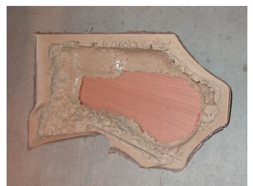
Figure 25. The molded door panel was removed from the door, but the mold came with it. The KLEAN KLAY® and the wood form were subsequently removed. KLEAN KLAY® residue was thoroughly removed using acetone. The inside surface of the molded part was sanded with 36-grit sandpaper and again thoroughly cleaned with acetone.