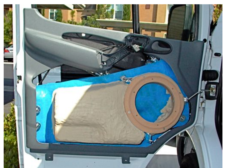
Figure 7. The mold for the front half of the enclosure was formed from foam blocks and KLEAN KLAY® (Art Chemical Products, visit <u>http://www.kleanklay.com</u>). The back panel and the MDF ring were protected with masking tape to prevent the absorption of clay residue.