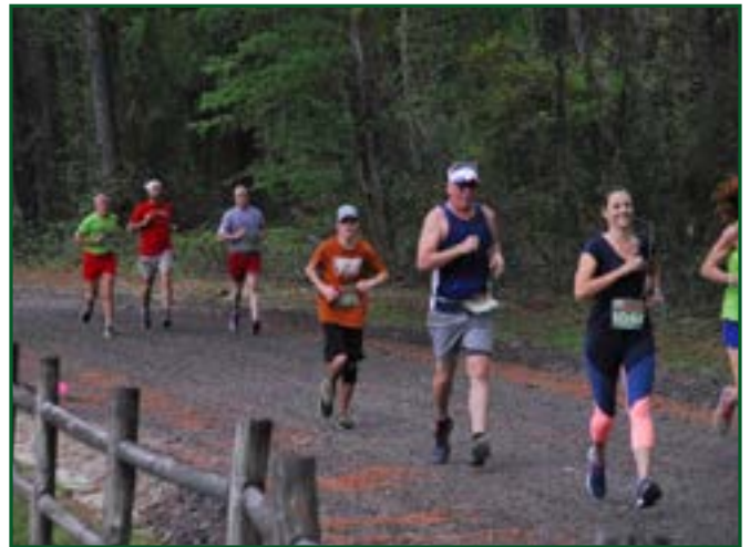
10K Swamp Run

As a recipient of the hard work of all these club members we here at the camp say thank you. Lions are asked each year to attend if possible and cheer these runners on. Sometimes you can just stand along the race course, hand out a bottle of water, give them a clap of hands as they pass by, and cheer them on. Everyone likes a little encouragement. Save the Date! Next, year around about the third Saturday in March. Try to make plans to come to the camp and be a part of a great event. Those who can (Lions) are more than welcome to participate. Run or walk, you will be rewarded in many ways.