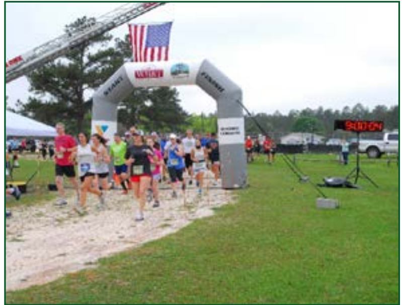
10K Swamp Run

Volunteers arrive early that Saturday morning to set up the starting line and complete last-minute preparations. This year's race would require some precautionary measures to be done because of the past year's pandemic. Registrations for the runners was to be a bit different than previous years.