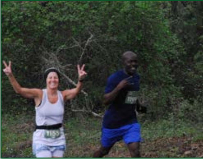
10K Swamp Run

we have campers of all ages. Maybe not the strollers yet!