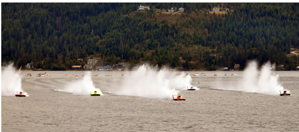
Karl Pearson photo