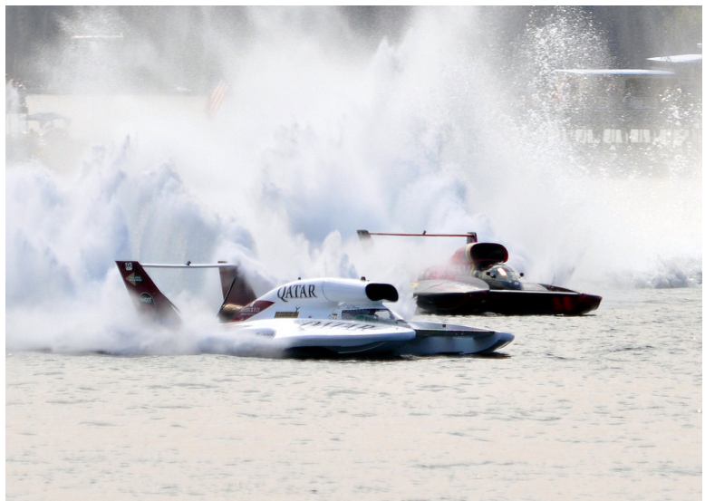
Karl Pearson photo