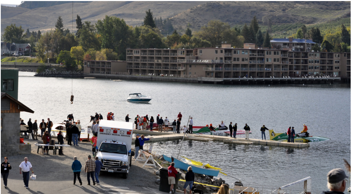
Lined up at the dock above are Miss Wahoo, Oh Boy! Oberto, and Miss Bardahl. Below are the Gale V(3), Miss Wahoo, Miss Bardahl, and Miss Thriftway. The Grandview On The Lake Resort and Hotel is in background~