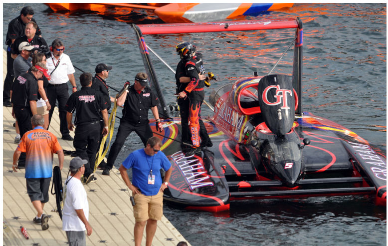
Karl Pearson photo