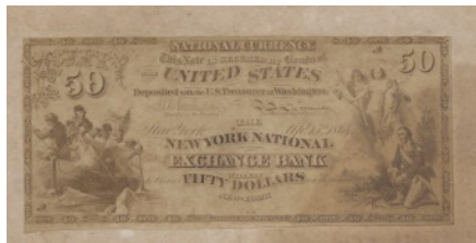
A $50 Banknote

While James Monroe’s 1817 election may usher in an “era of good feelings,” this spirit does not extend to the economy. Instead, the “boom cycle” of the war years is about to morph into a “bust cycle” causing widespread national misery.