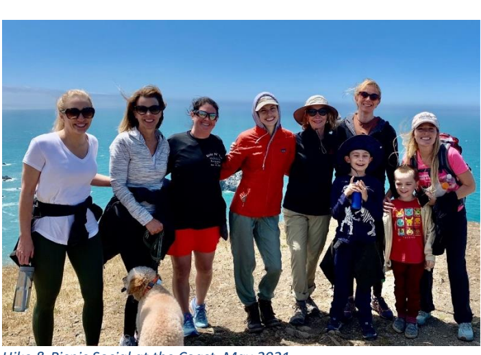
Hike & Picnic Social at the Coast, May 2021