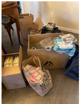
Donating Valley of the Moon Children's Home "Go Bags" for infants, February 2021