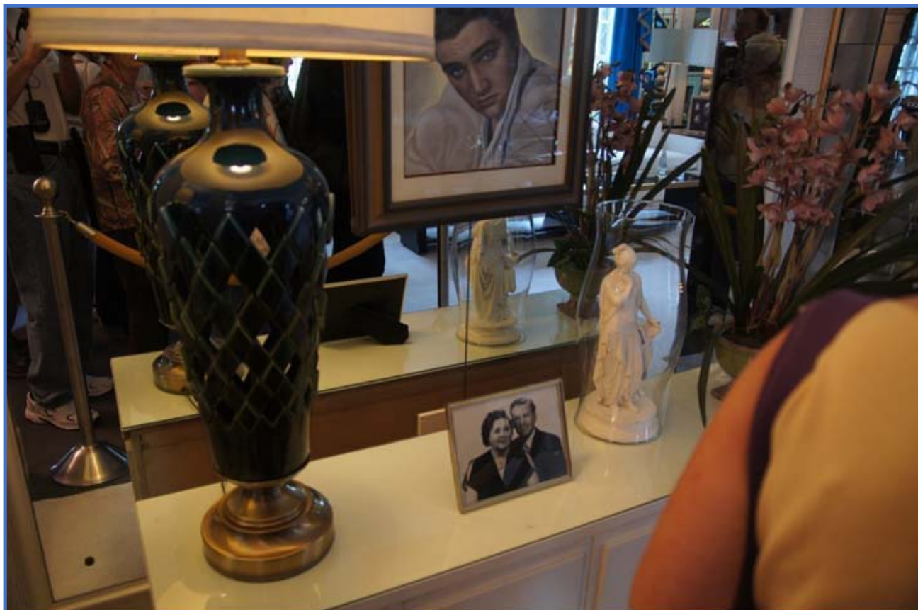
Inside Elvis Presley's Mansion.