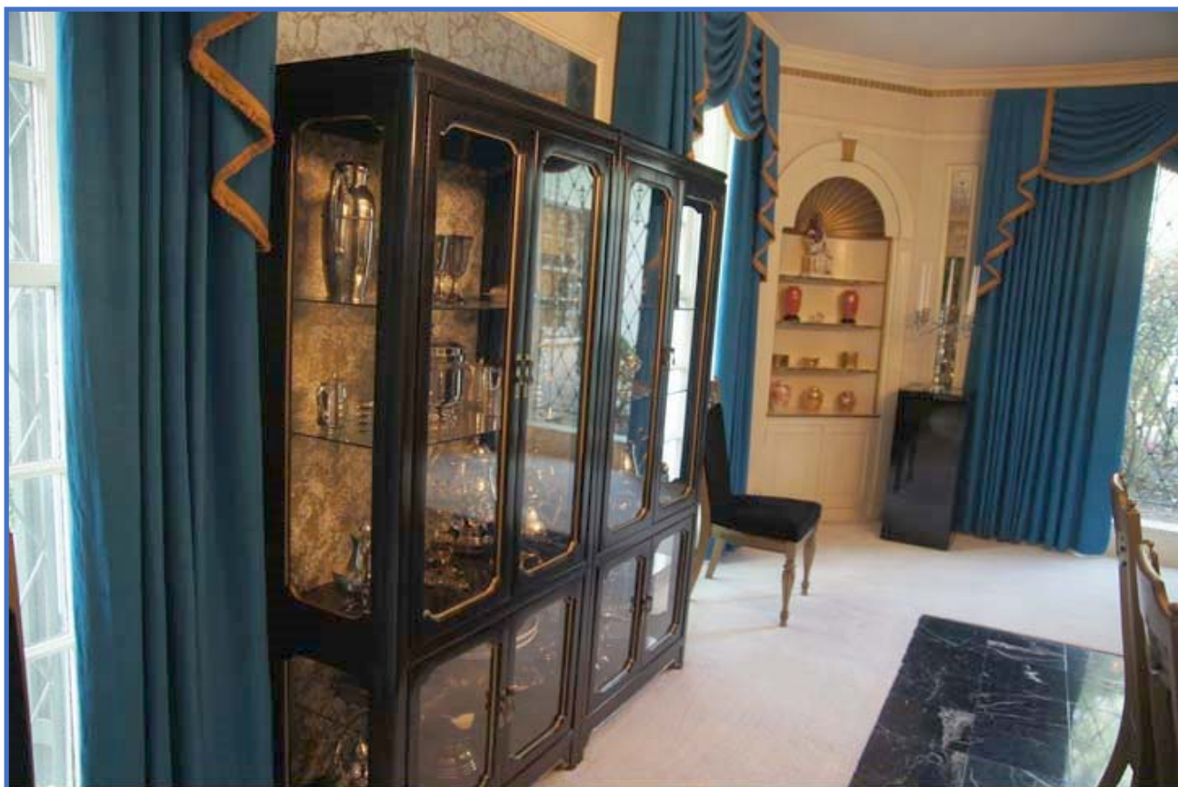
A chinaware cabinet.