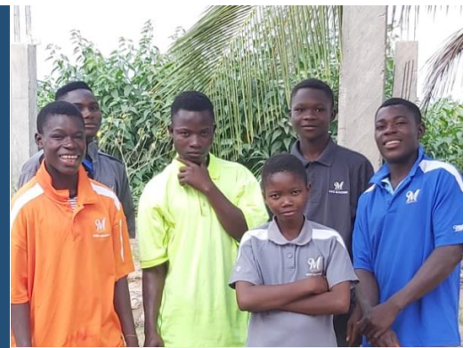
Kids in Ghana strike a pose in their new shirts!

The Salvatorian Mission Warehouse continued to provide relief to those most in need even as the pandemic raged in 2020.