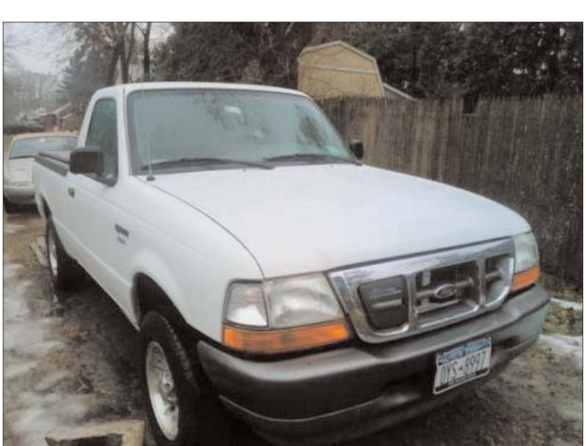
Corey Rideout is the current owner of this 2000 Ford Ranger pickup EV.

low connections and such but it's all functional. I'll clean up the wires a bit later.