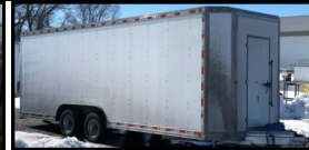
24ft Tag Delivery Trailer (2) 8,000lb Axels

Over 300 Full Leather Hides & Half Hides, Approximately 50 Boxes of Large Leather Pieces, Over 30,000 yards of Upholstery Fabric Consisting of Silks, Cottons, Cotton Blends, Mohair's, Chenille's, Velvets, Jacquard's, Marine Vinyl's Plus Many More. Store Equipment including Cutting Tools, Rolling Machine, Cutting Table, Shop Carts, Fabric Bagging Machine, Genie Lift & More