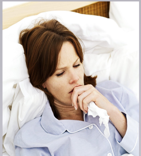
We do in fact serve a loving God, but God's mercy is as strong as his punishments. God has always punished sin on the earth, and pestilences are one of His devices. Diseases have killed much of the man on the earth, and this particular one, Ebola, is extremely dangerous.

Remember what God said in 2 Chronicles 7:14: If my