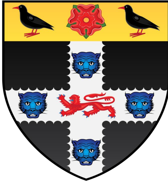
Above: the Coat of Arms for Christ Church College, Oxford University; https://www.chch.ox.ac.uk/

cardinal because of you alone", and the motto meant "because I am from Bergamo and a friend". 1