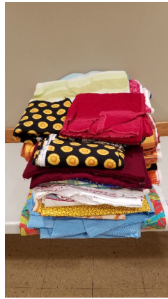
Our washed, ironed, and folded fabric for the feminine hygiene project!

To visit the website for the Diocese of Toliara, click on the image above.