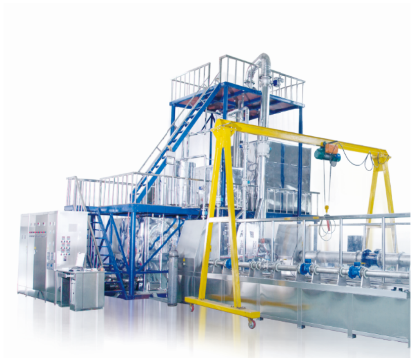
High-accuracy calibration platform