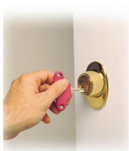
Key Turner Grip