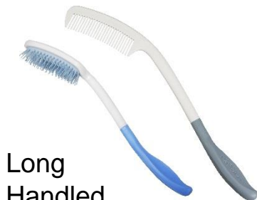
Long Handled Brush