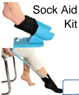
Sock Aid Kit