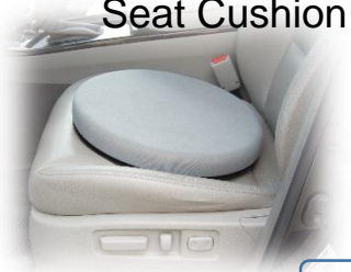
Padded Swivel Seat Cushion