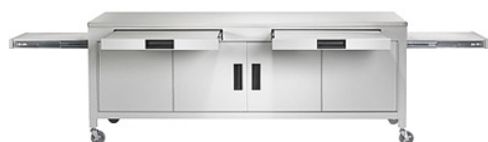
Cabinet for Printer & Conveyor