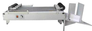
Conveyor & Drop-Tray Extension