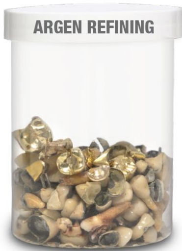
1 Scrap Lot S1092717