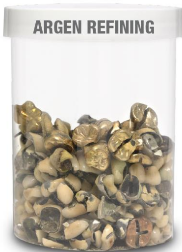
2 Scrap Lot S1092727