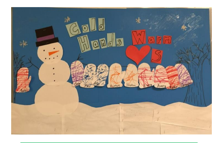
Figure 2: Mrs. Shannon's toddler's art.