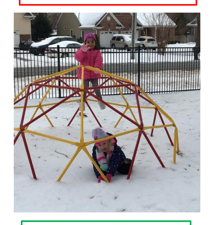
Figure 5: More snow day fun!