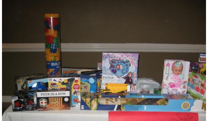
Toys for Tots