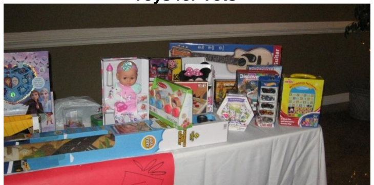
More Toys for tots