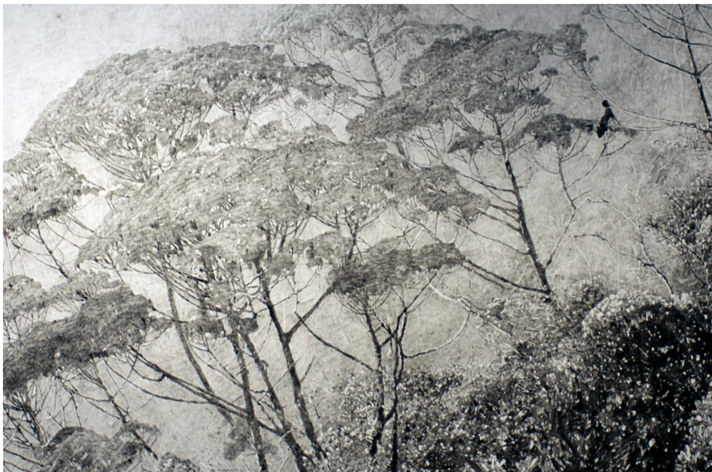
HUGO BASTIDAS: KNOWING WHERE YOU ARE , 2015, oil on linen, 48 x 72 in. 122 x 183 cm.

We see a common element of circulation in these paintings, of nature wrapping the scene, a symbol of the circle of life, where everything is connected in a sense of grandness. So Similar (2015) becomes even more literal, with circles floating and ovals hanging, a visual metaphor of how the differences in our cultural and political systems become contiguous in their extremes.