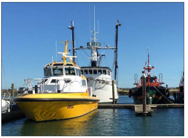
New pilot boat VEGA (foreground left) at Westport Marina. The current GH pilot boat, the CHEHALIS, can be seen on the far right.

The Port of Grays Harbor has acquired a new pilot boat. The VEGA arrived from Long Beach, CA at Westport Marina in early September. According to the Port, staff will be working through repairs and modifications before putting the vessel into service.