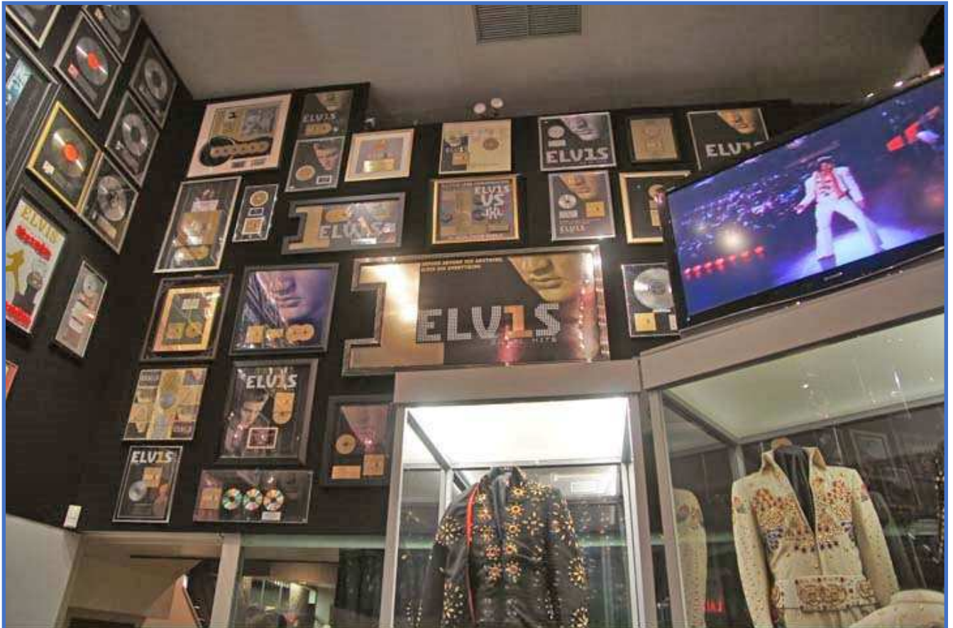
Awards stacked to the (high!) ceiling.