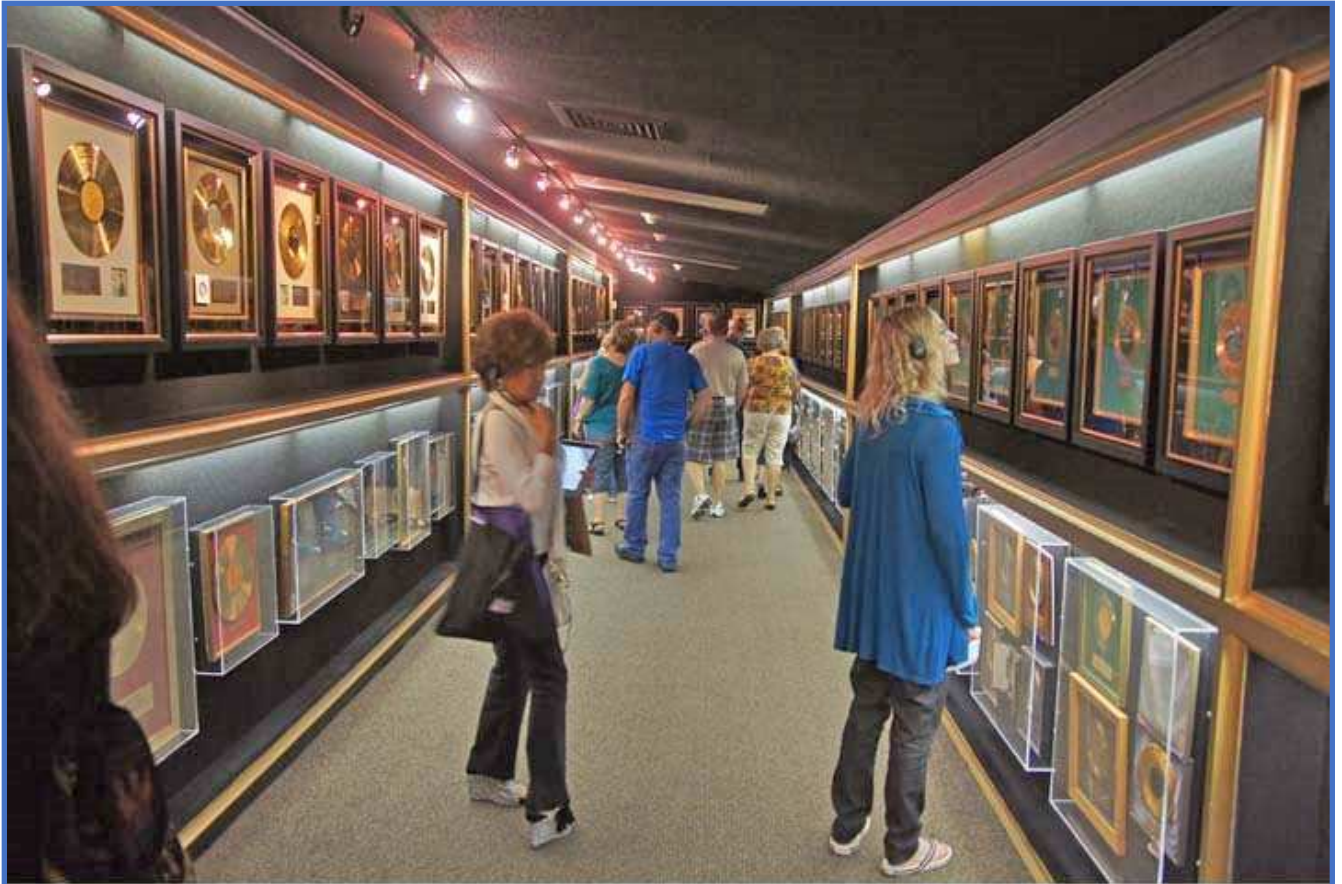
Some of the Gold and Platinum Record Awards Elvis received.