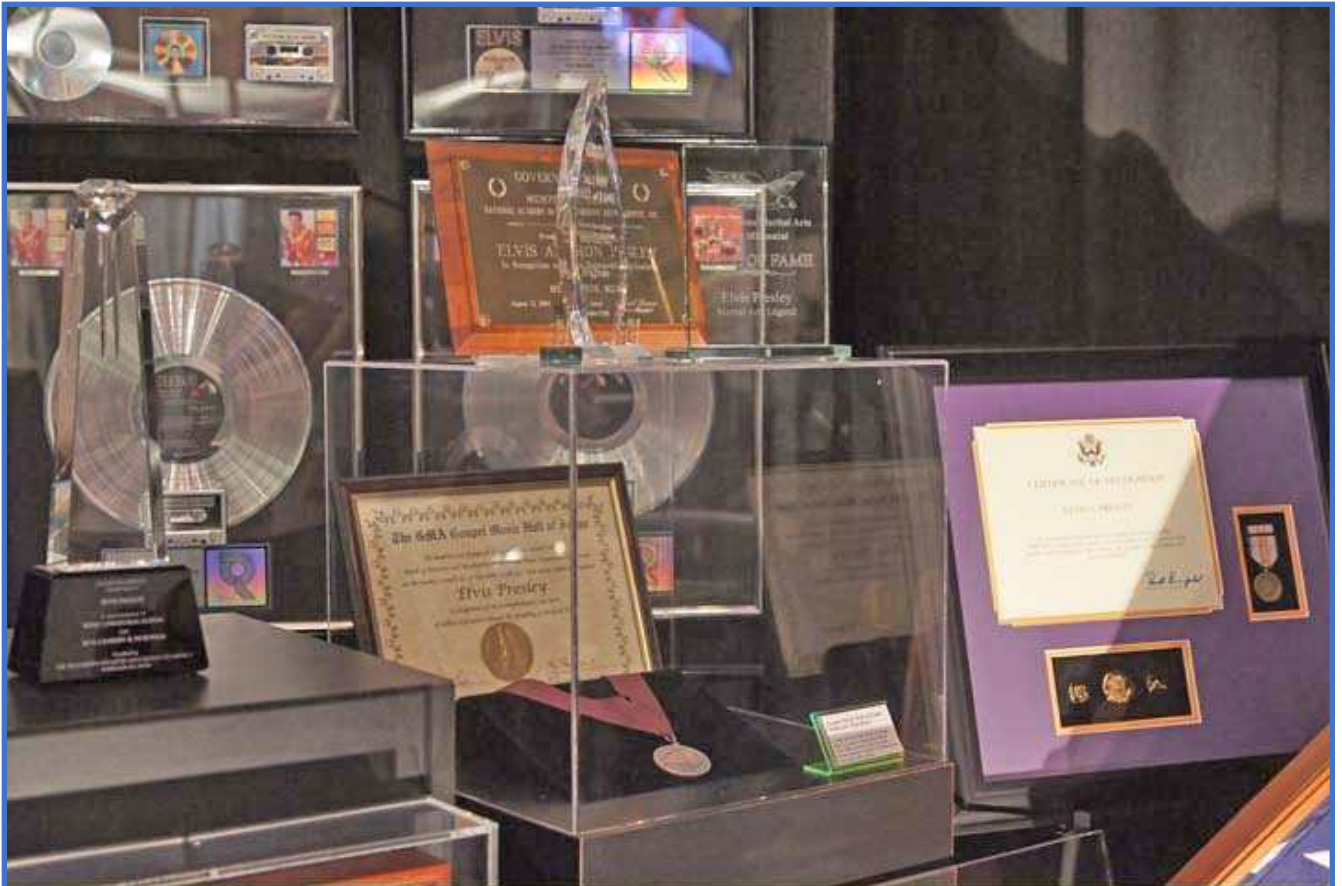
Awards, awards and awards.