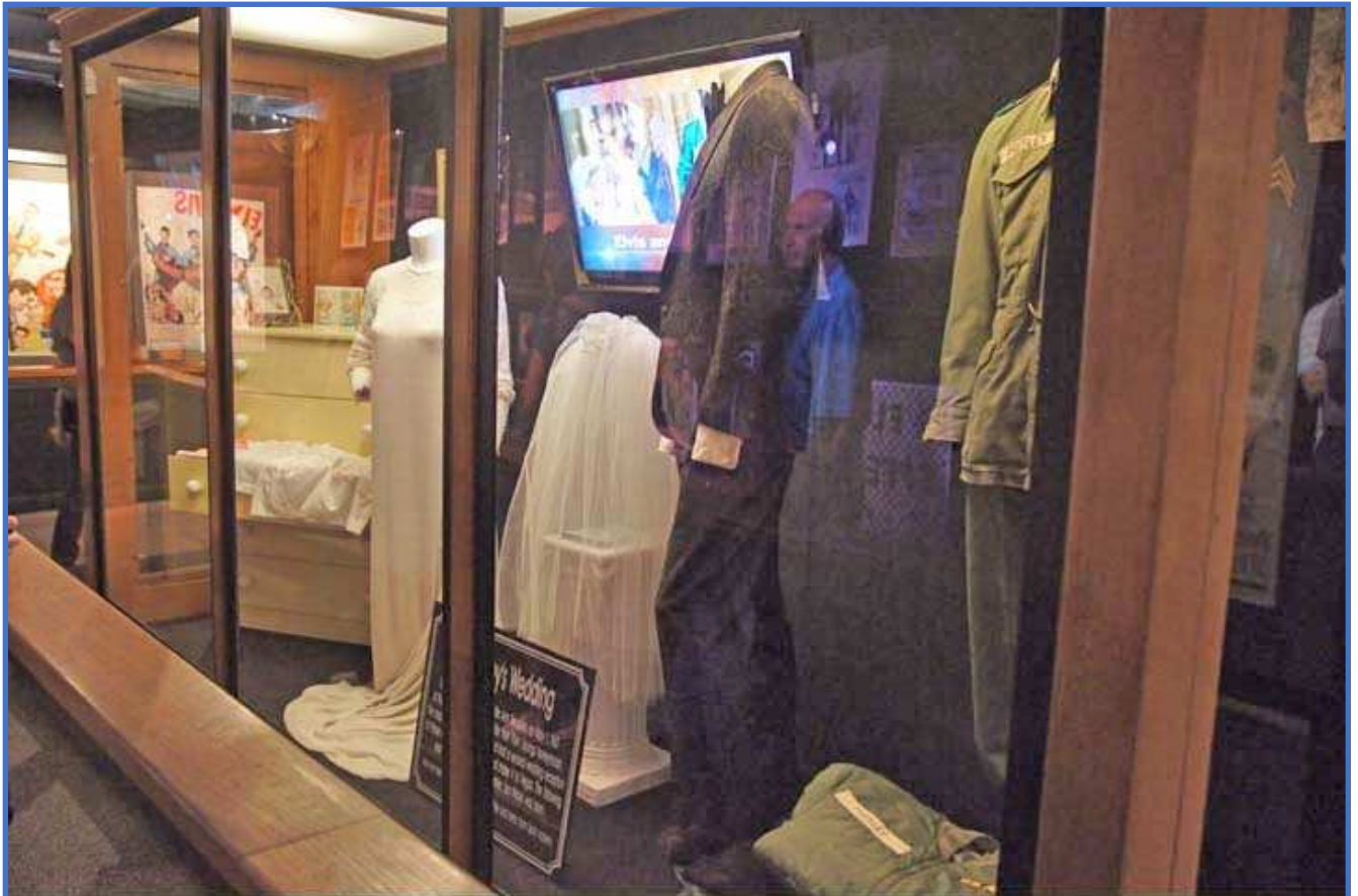
Elvis's and Pricilla's wedding clothes.